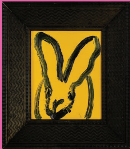
"Jackie O" 2021, Oil on wood, 10 x 8 in. TD0169