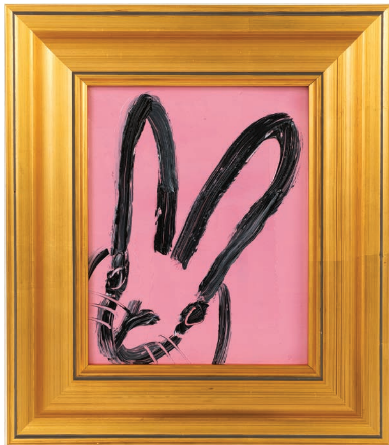
"Audrey Again" 2022, Oil on wood, 10 x 8 inches, CX01250