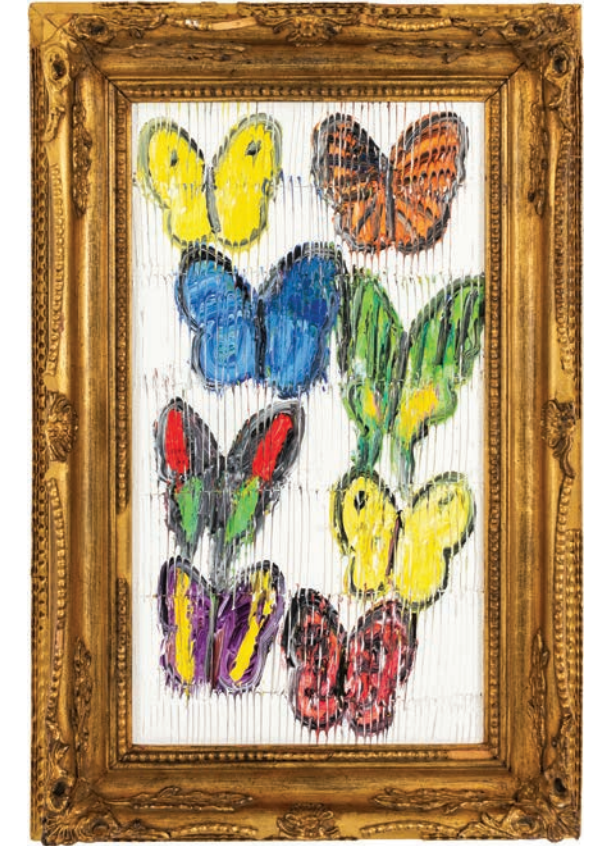
"Monarch & Viceroy Day" 20.5 x 11.5 inches, Oil on wood, 2021, TD0520