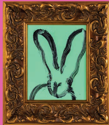
"Deerfield Green" 2021, Oil on wood, 10 x 8 in. TD0500