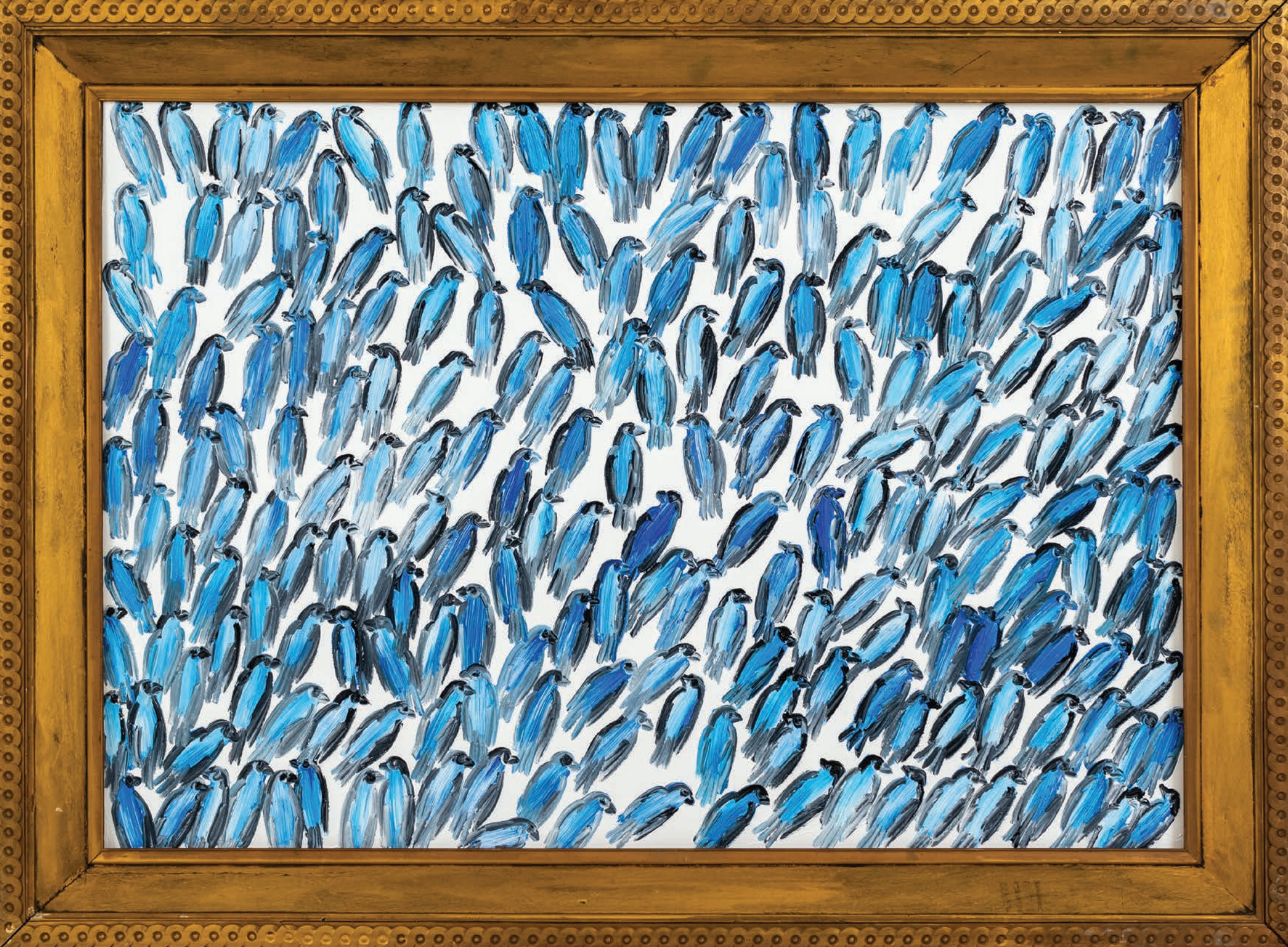
"Cordon Bleu" 2021, Oil on canvas, 37 x 53 inches, TD0132