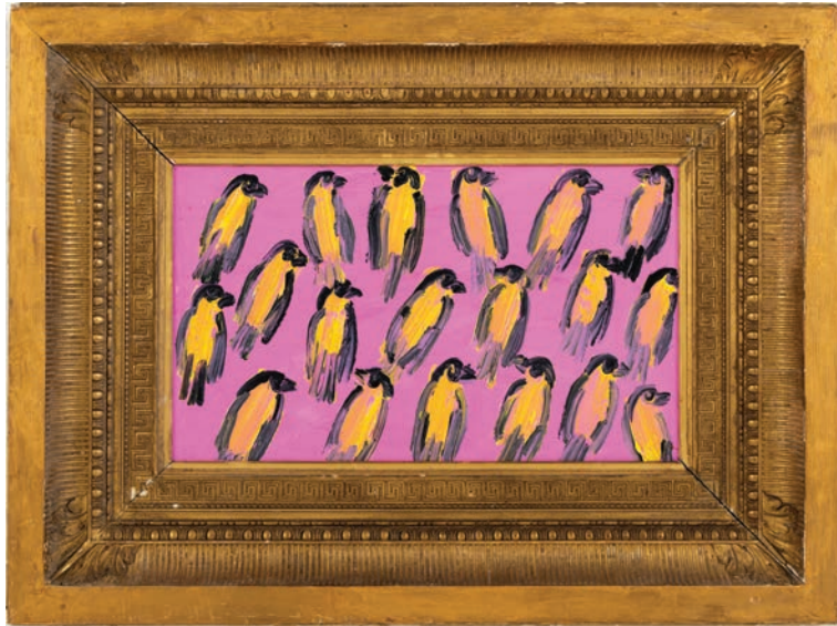
"Green Singers III"

2022, Oil on wood, 12 x 20 inches, CX0973