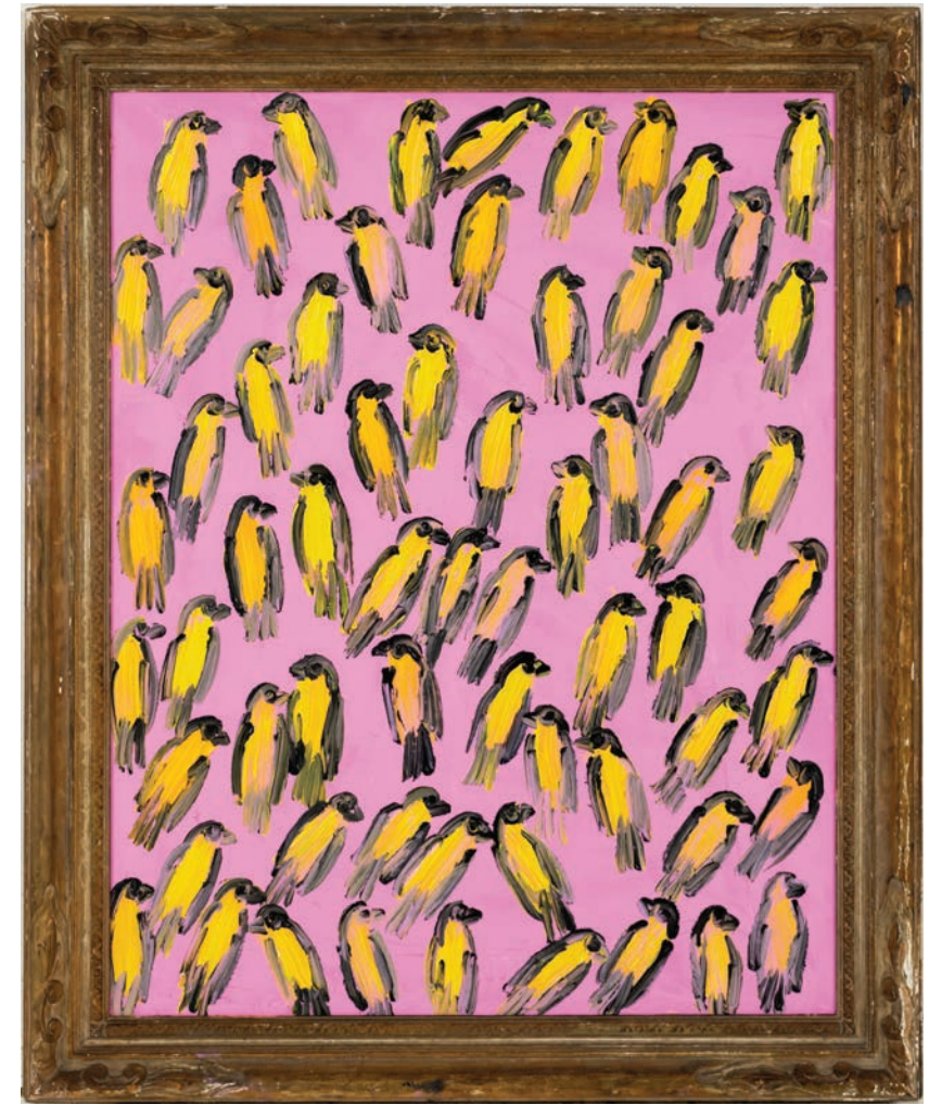
"Green Singers" 2022, Oil on wood, 33 x 26 inches, CX0948