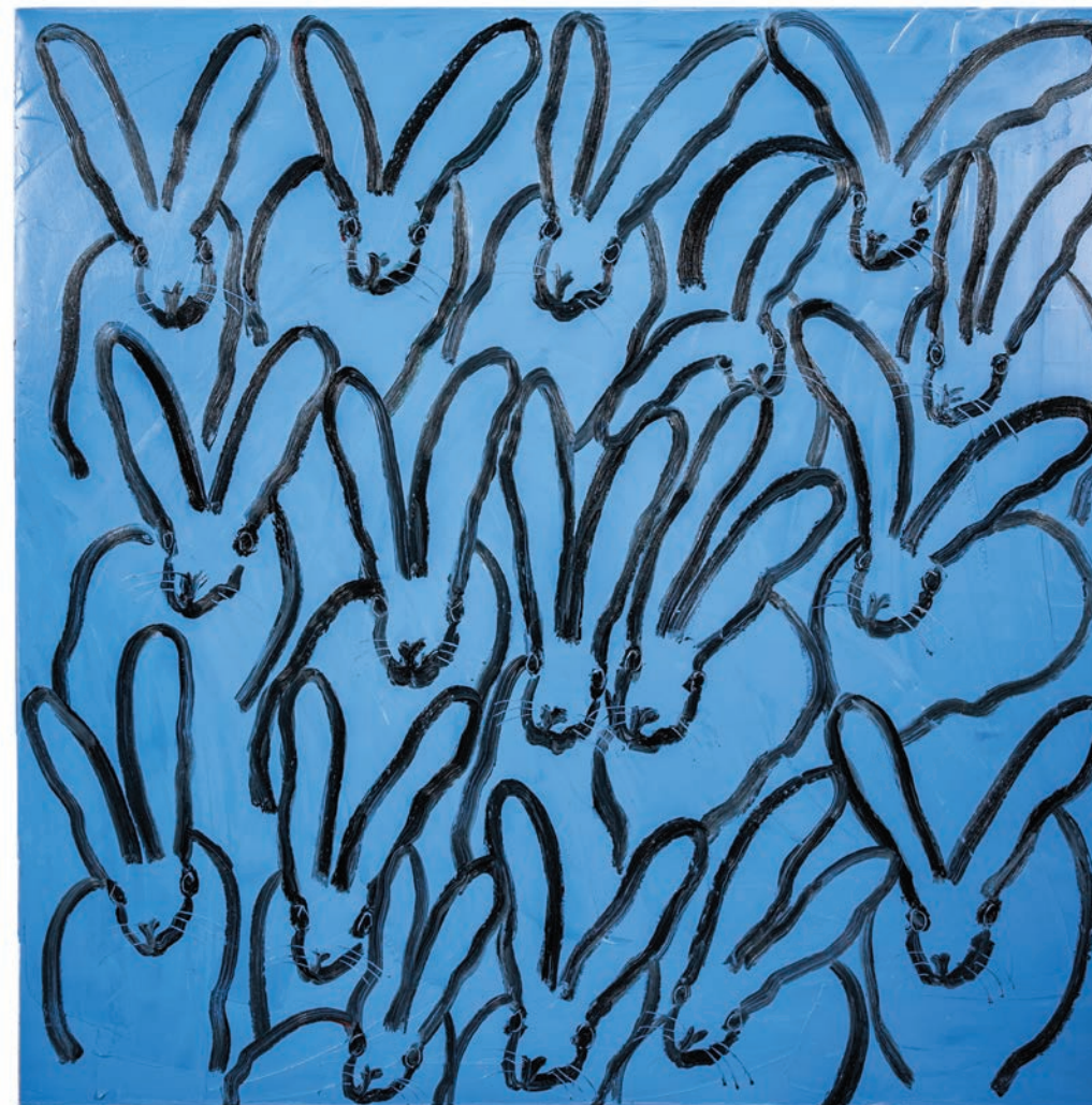
"Blue Hutch 2" 2022, Oil on canvas, 48 x 48 inches, SH0830