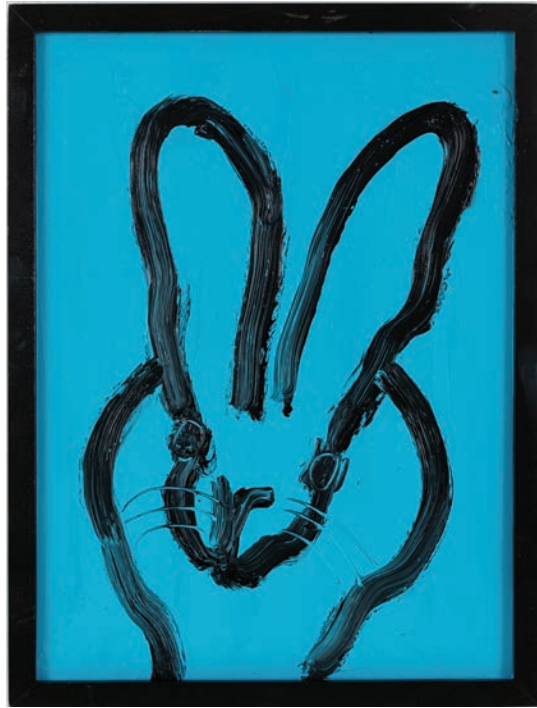
“Bayou Blue” 2022, Oil on wood, 16 x 12 inches, CX1170