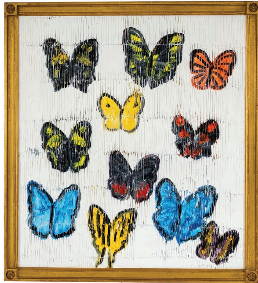
"Clearing" 2021, Oil on wood, 26 x 23.5 inches, TD0131