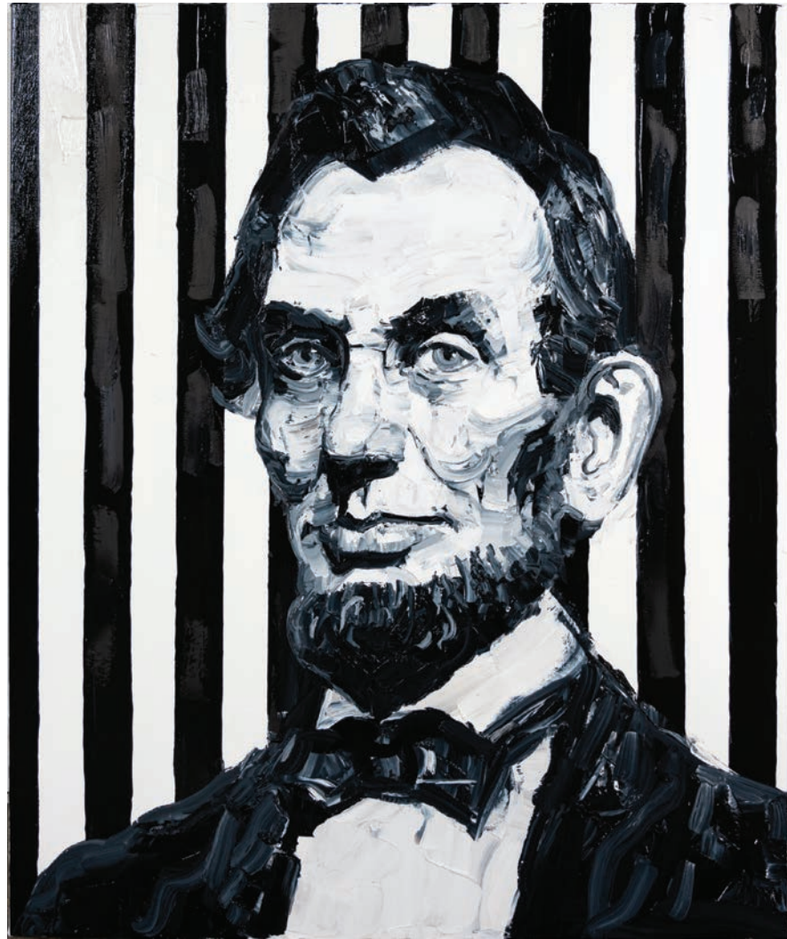
"Lincoln Twilight" 2022, Oil on canvas, 36 x 30 inches, SH0629