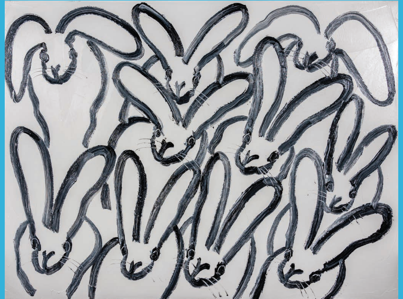
"Hutch Virginia" 2022, Oil on canvas, 30 x 40 inches, SH0525