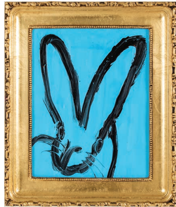
"Sky Hop" 2021, Oil on wood, 10 x 8 in. TD0443