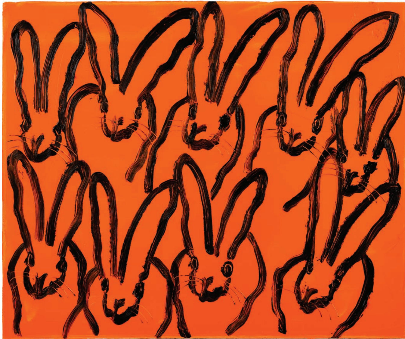
"Clockwork Orange" 2021, Oil on canvas, 30 x 36 inches, CSR2737