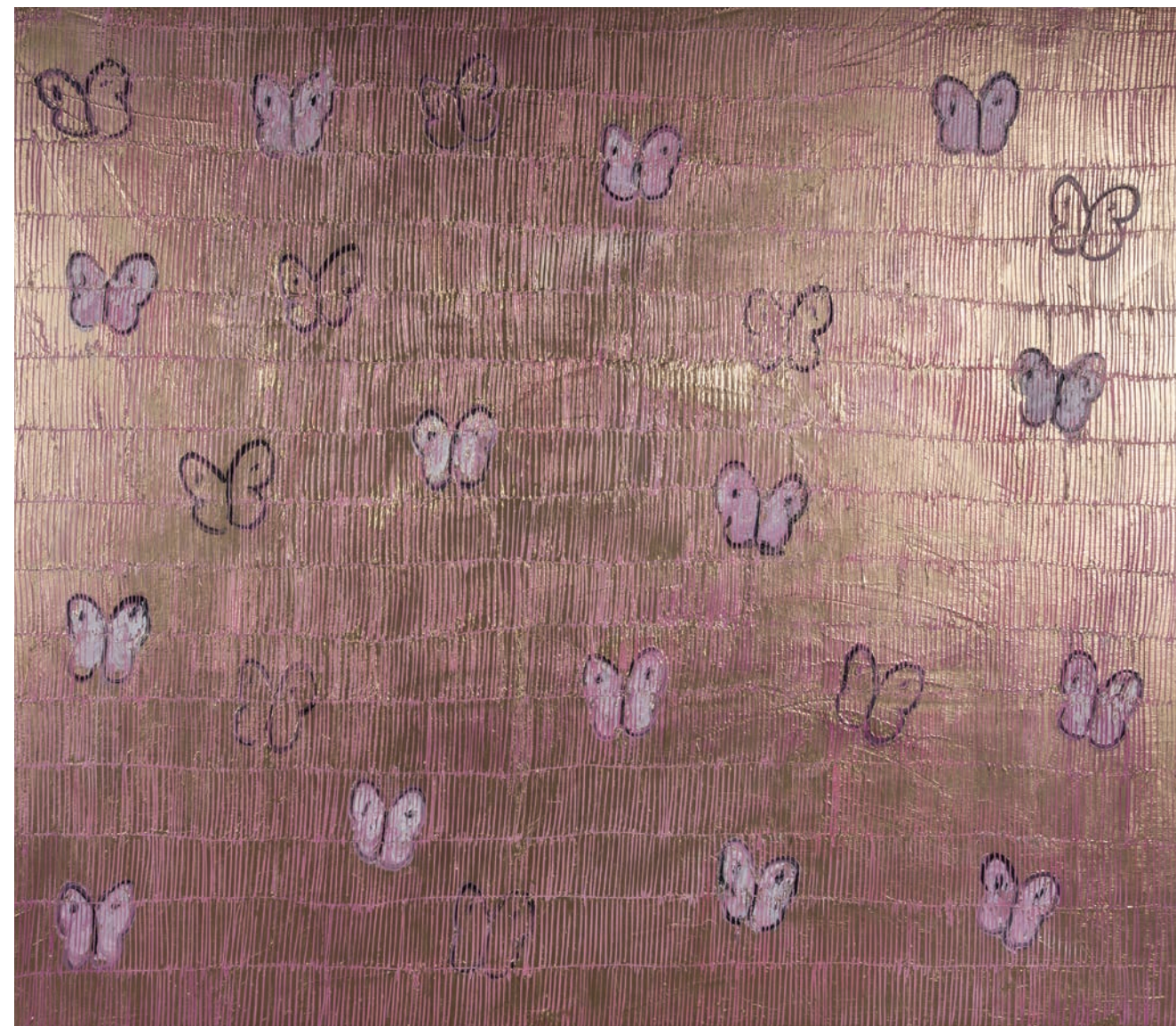
"Pink Ascension" 2022, Oil on canvas, 60 x 70 inches, SH0511