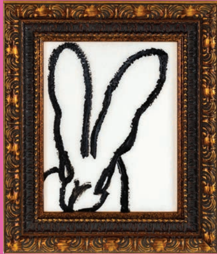
"White Bunny Diamond" 2021, Oil & Acrylic w/ Diamond Dust on wood, 10 x 8 in. TD0451