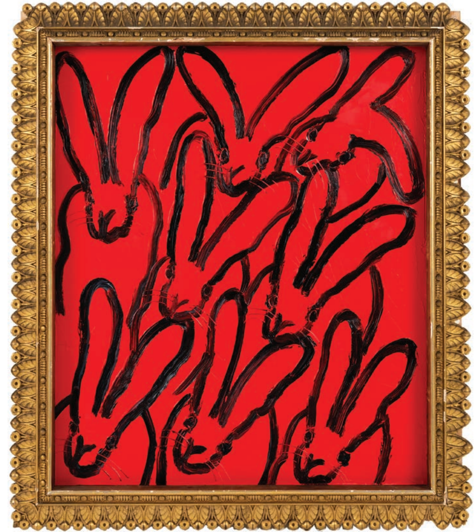
"Red Hutch" 2021, Oil on wood, 33 x 28 inches, CX0579