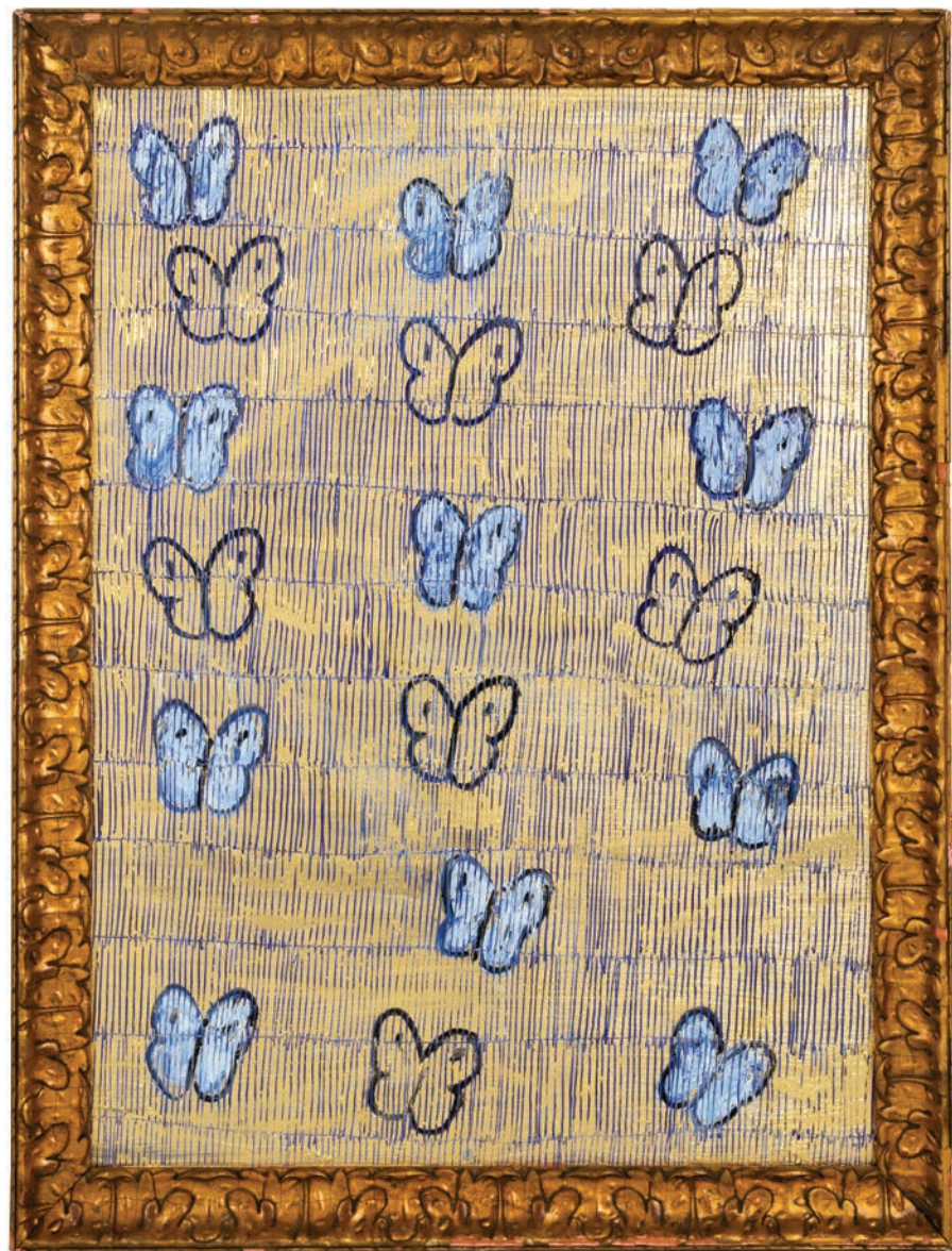
"Dream Weaving Ascension II" 2022, Oil on wood, 48 x 35 inches, JW0214