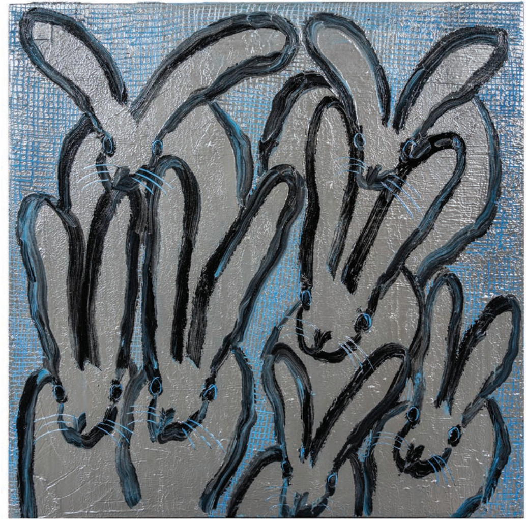
"Scored Hutch" 2022, Oil on canvas, 30 x 30 inches, SH0726