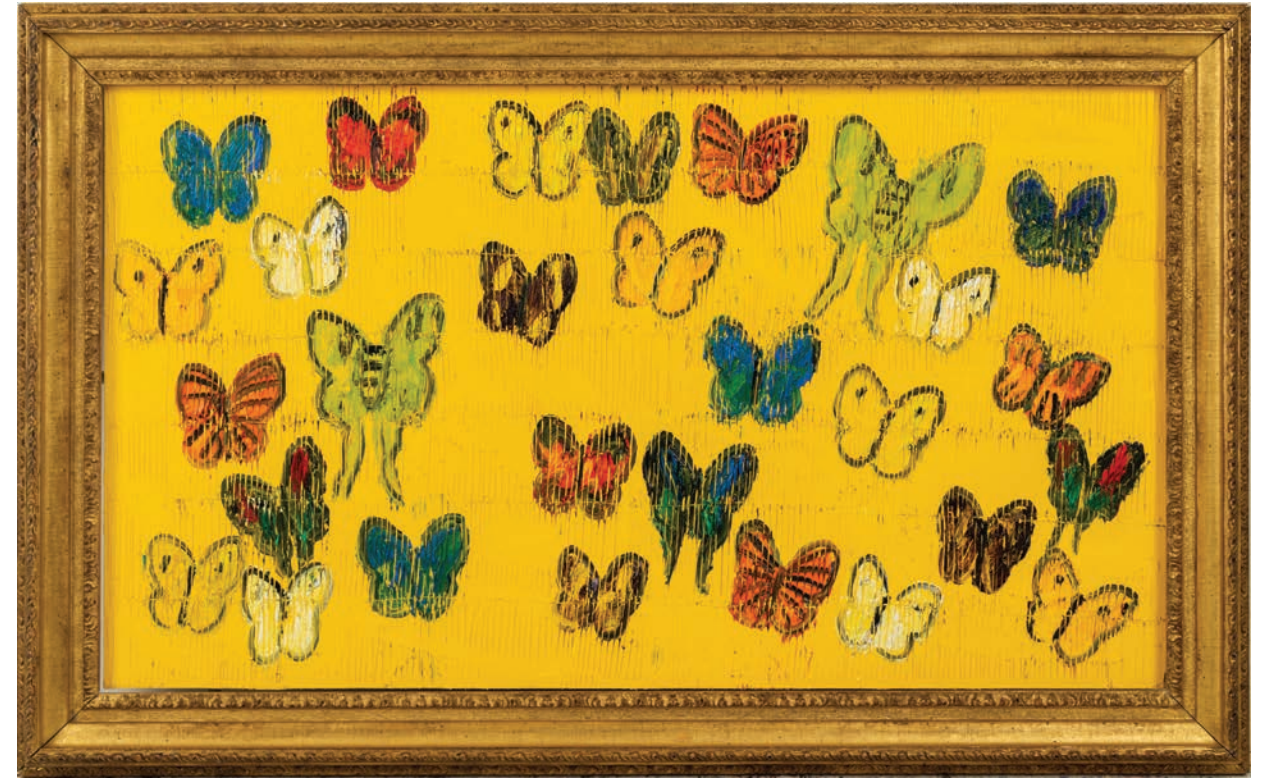
“Yellow Migration Question Mark Comma” 2021, Oil on canvas, 30 x 52.5 inches, TD0219