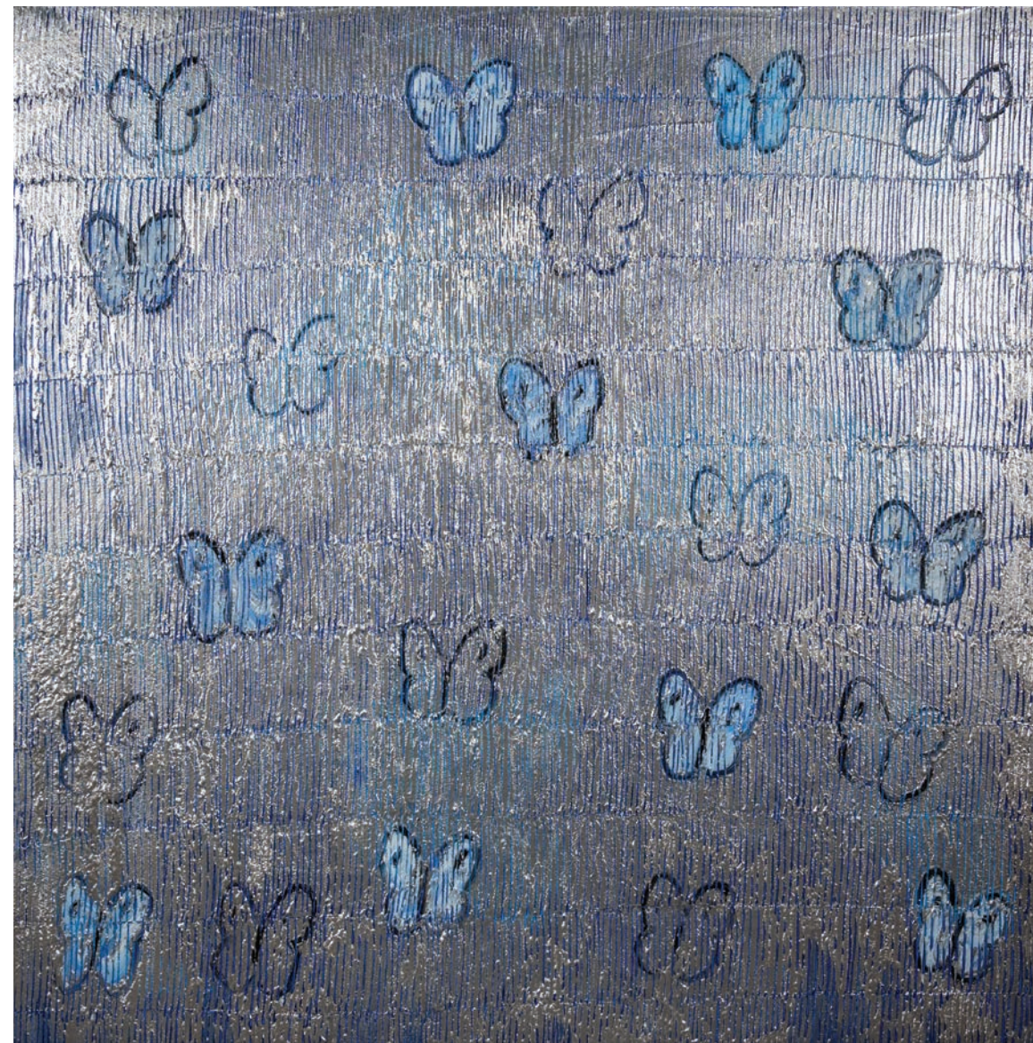
"Blue Ascension Tuesday" 2022, Oil on canvas, 48 x 48 inches, SH0832