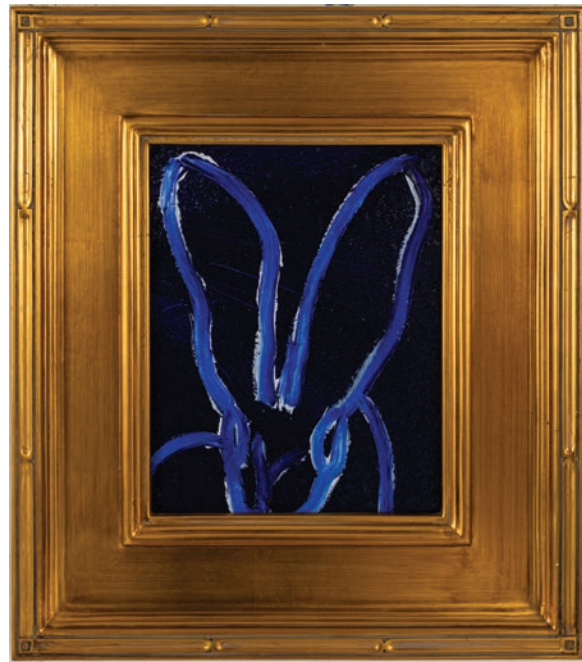
"Blue Tangle Diamond" 2021, Oil & Acrylic w/ Diamond Dust on wood, 10 x 8 in. TD0208