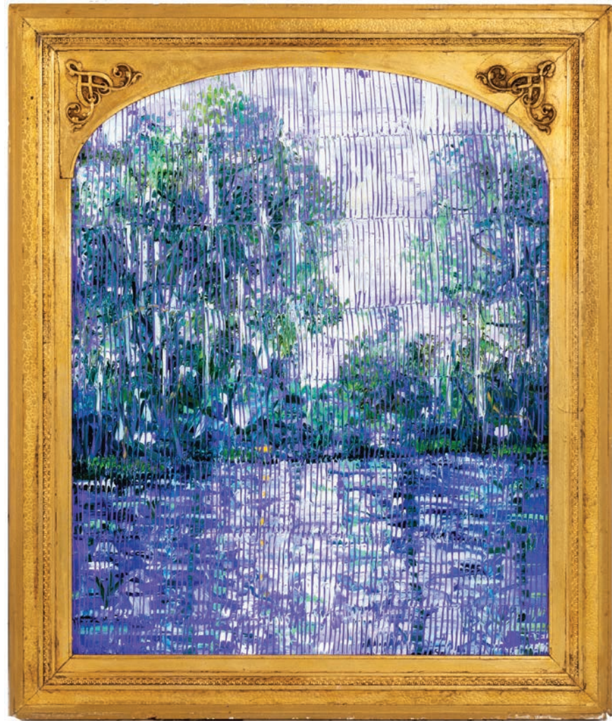
“La Fouche Assumption Parrish” 2022, Oil on Wood, 27 x 22 inches, CX0900