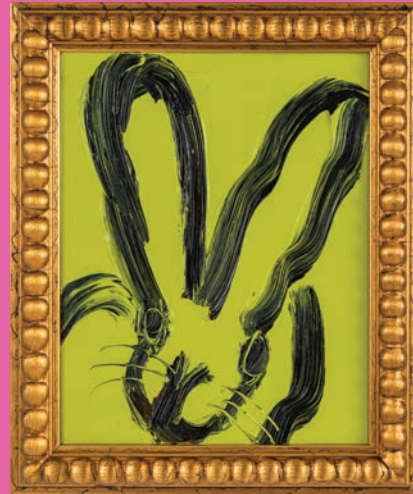
"Limeade" 2021, Oil on wood, 10 x 8 in. TD0465