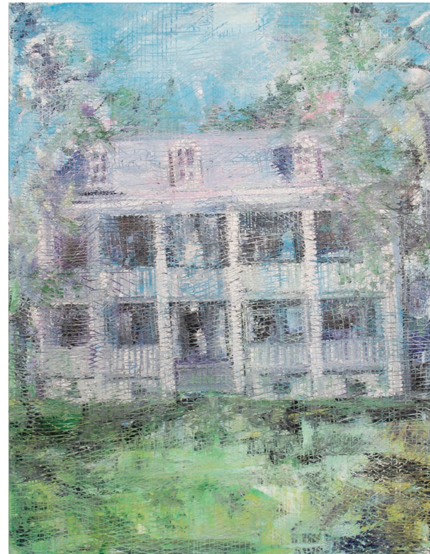
“Untitled” 2010, Oil on canvas, 40 x 30 inches, CKS0204