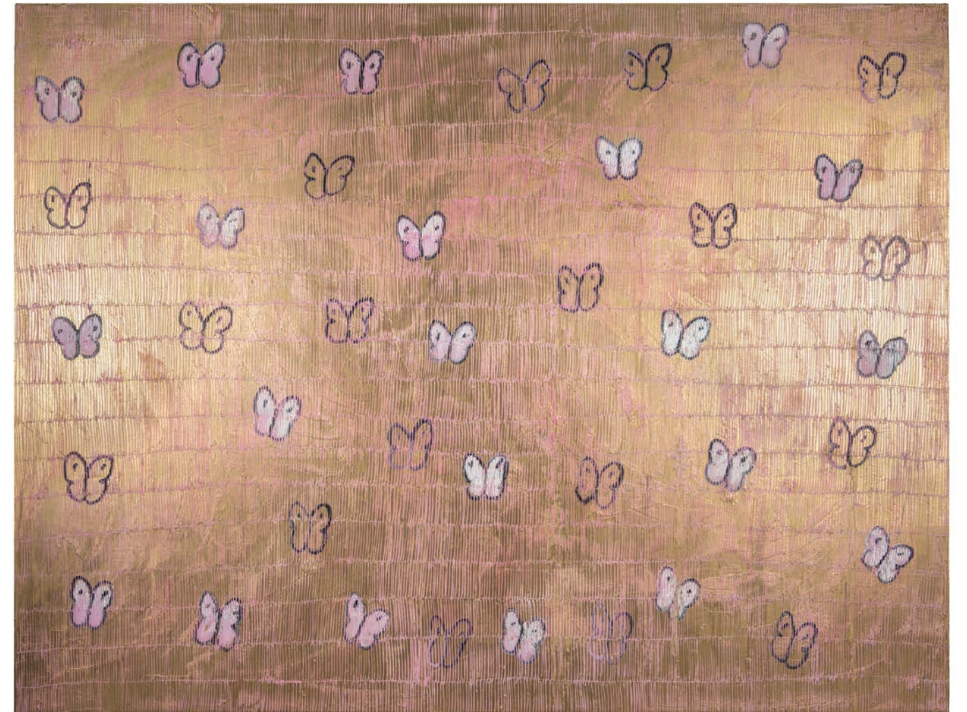
"Pink Ascension (Tues)" 2022, Oil on canvas, 77 x 101 inches, CX1469