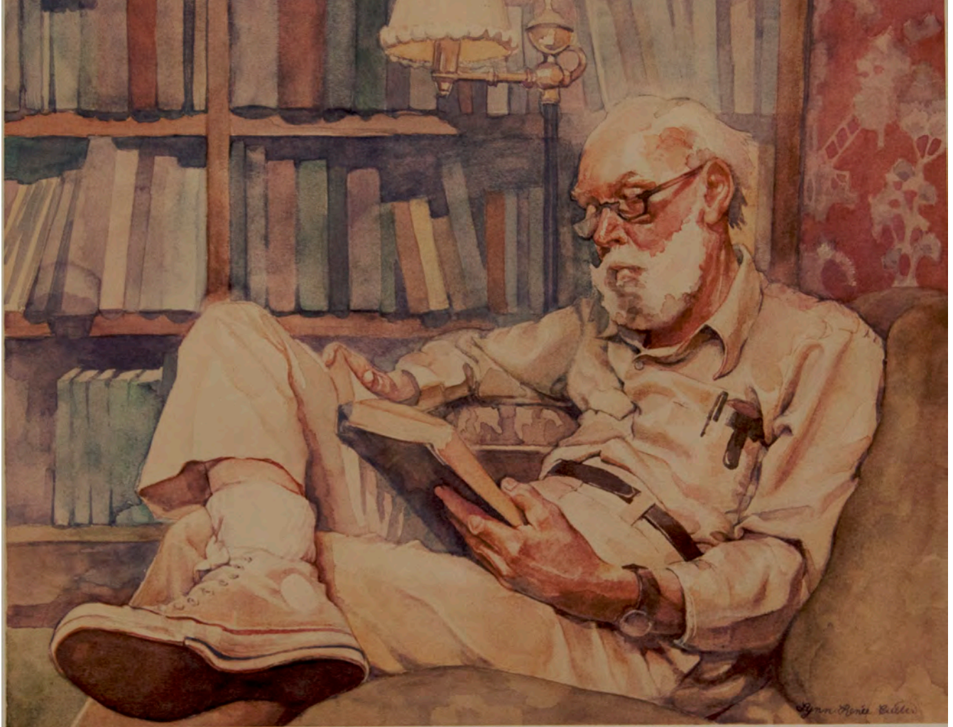
Old Man Reading , 12 x 16 inches, Oil on paper

My reaction was immediate. My heart pounded and my pulse quickened. The color relationships in those Sorolla paintings were so luscious I wanted to eat them. In the days and weeks that followed, a nagging and persistent voice taunted, dared and eventually lured me to purchase oil painting supplies and venture outside of the studio door.