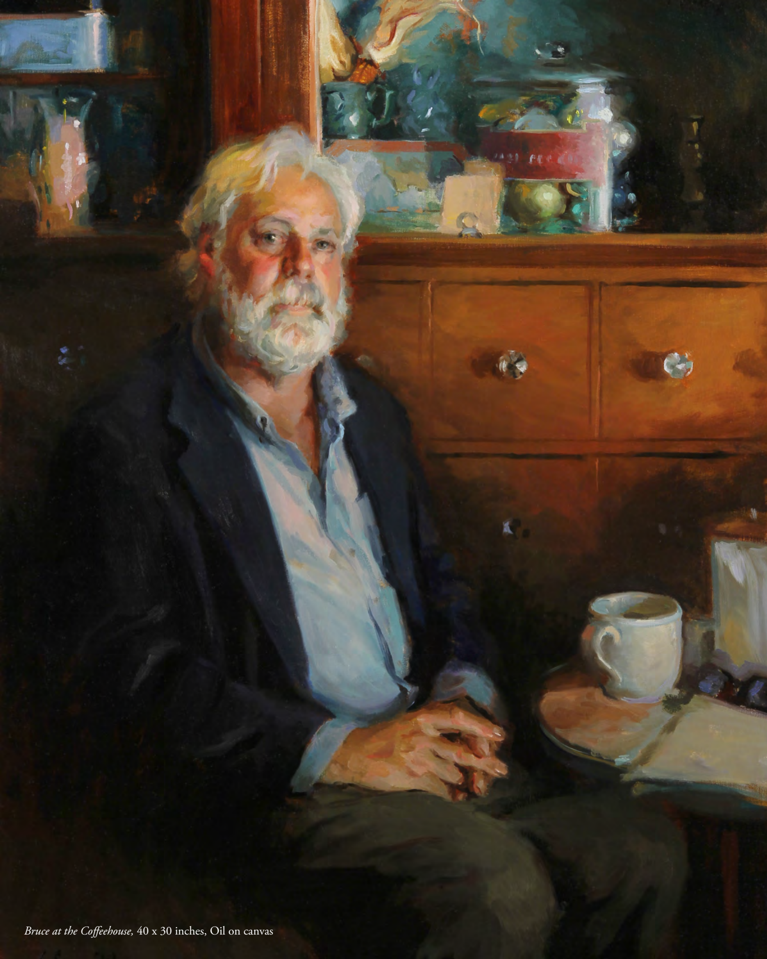
Bruce at the Coffeehouse , 40 x 30 inches, Oil on canvas