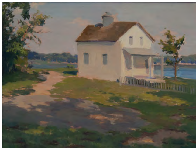
Alexandria Lighthouse , 16 x 20 inches, Oil on canvas