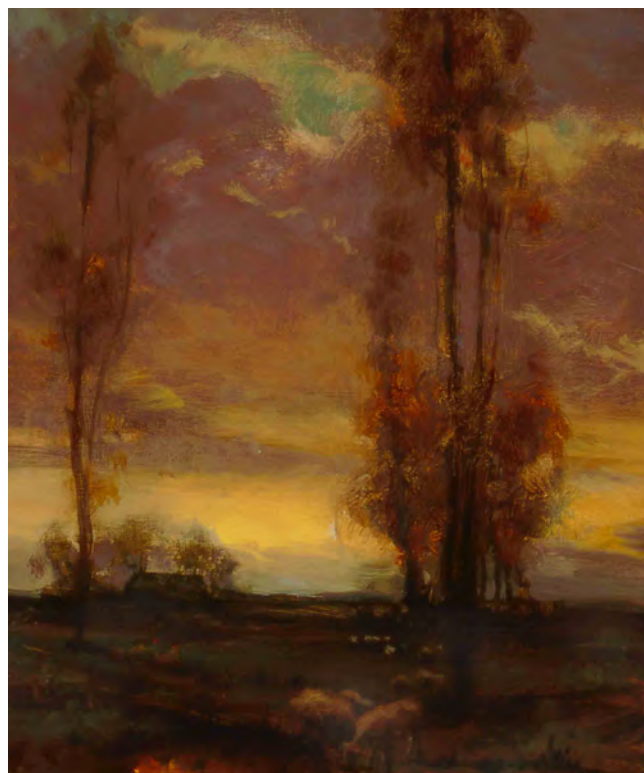
Afterglow, 12 x 9 inches, Oil on canvas

Learn more about Lynn Sanguedolce at: www.lrsanguedolce.com