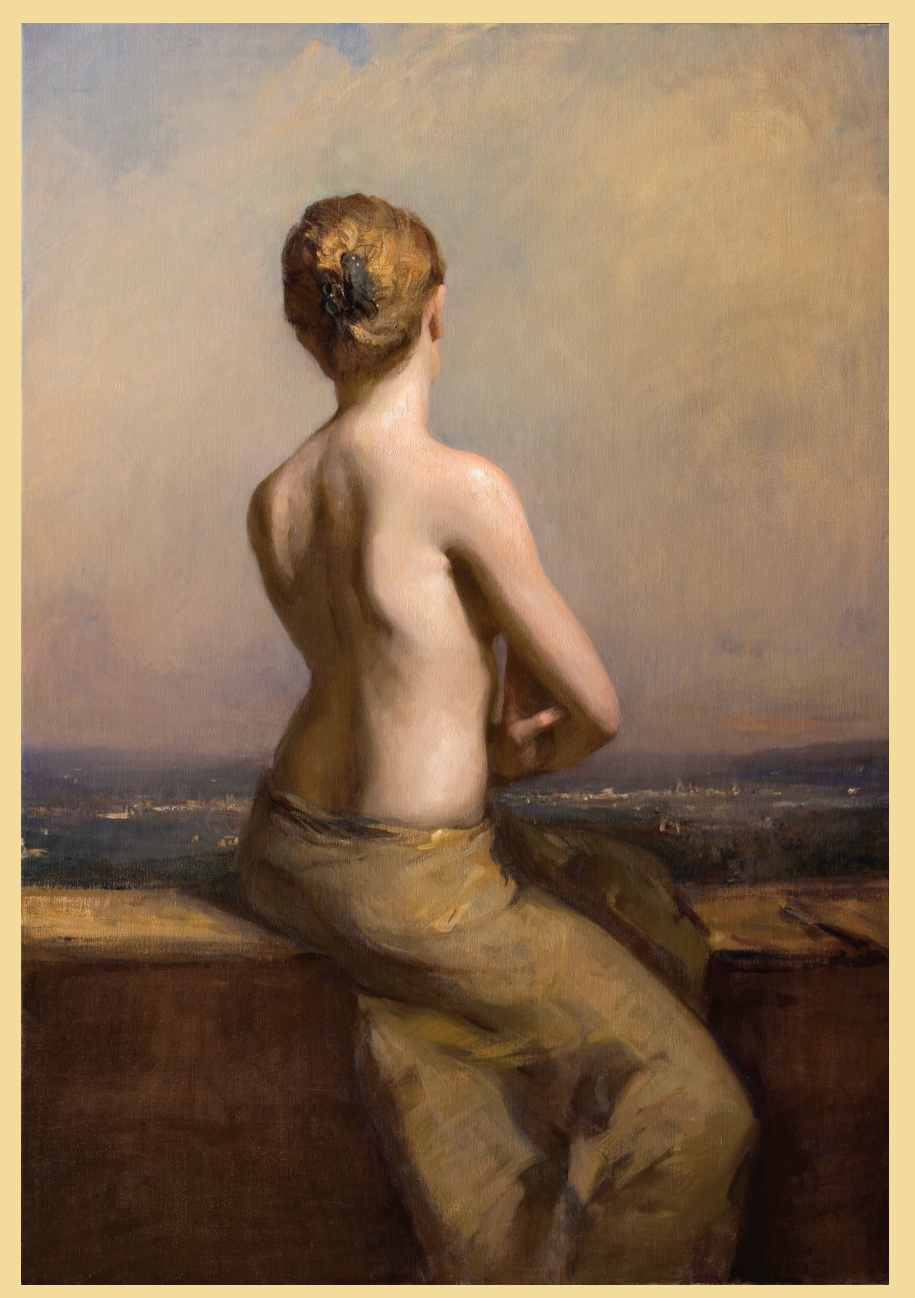
"Fiesole" by Ramiro, 51 x 35 inches, 0il, 2013