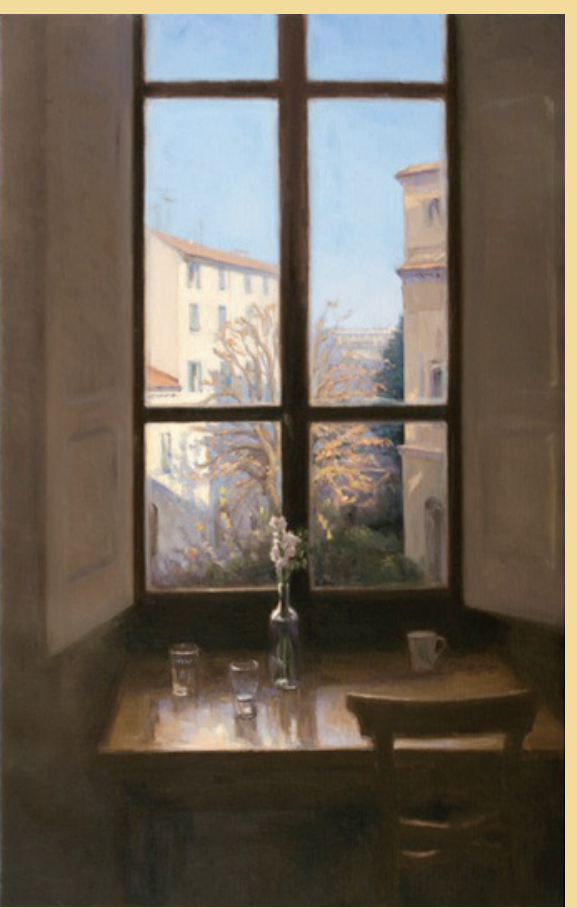
"My Window" by Melissa Franklin - Sanchez, 37 x 23.5 inches, Oil, 2013

using an Old Master technique, her paintings glow from within. Each dedicated to a different space in their home, these paintings not only provide aesthetic pleasure but a connection to the artist's environment and process. The viewer feels as if they could bask in the warm Italian rays seen in "Balcony," or prepare a meal in the welcoming kitchen shown in "Minutes." Sanchez's paintings transport the viewer into her Florentine flat, walk us from room to room, and leave us with a peaceful warmth.