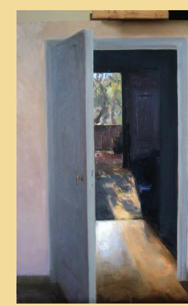
"Winter Light" by Melissa Franklin - Sanchez, 19.5 x 17 inches, Oil, 2013