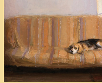
"9 am" by Melissa Franklin - Sanchez, 4.5 x 6.5 inches, Oil, 2013