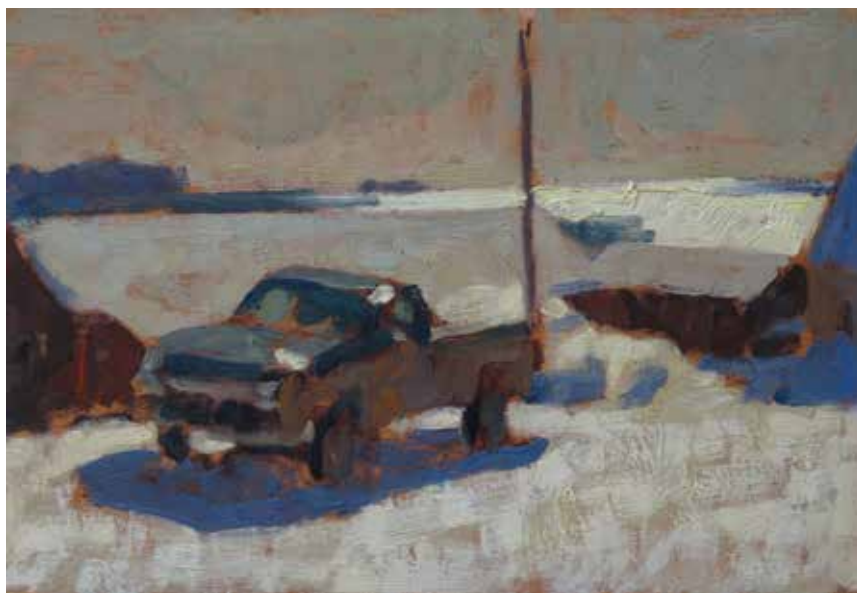
Ford F150 8 x 12 inches, oil on panel, 2011