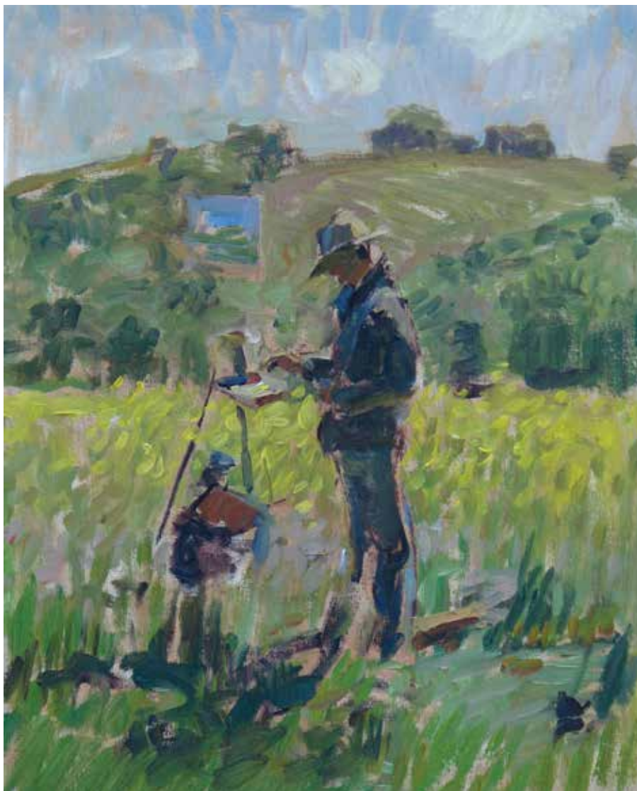
Artist Sketching, Marc Dalessio 20 x 16 inches, oil on linen, 2011