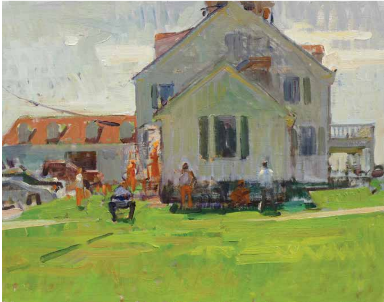
Prisoners at Montauk 21 x 27 inches, oil on linen, 2011