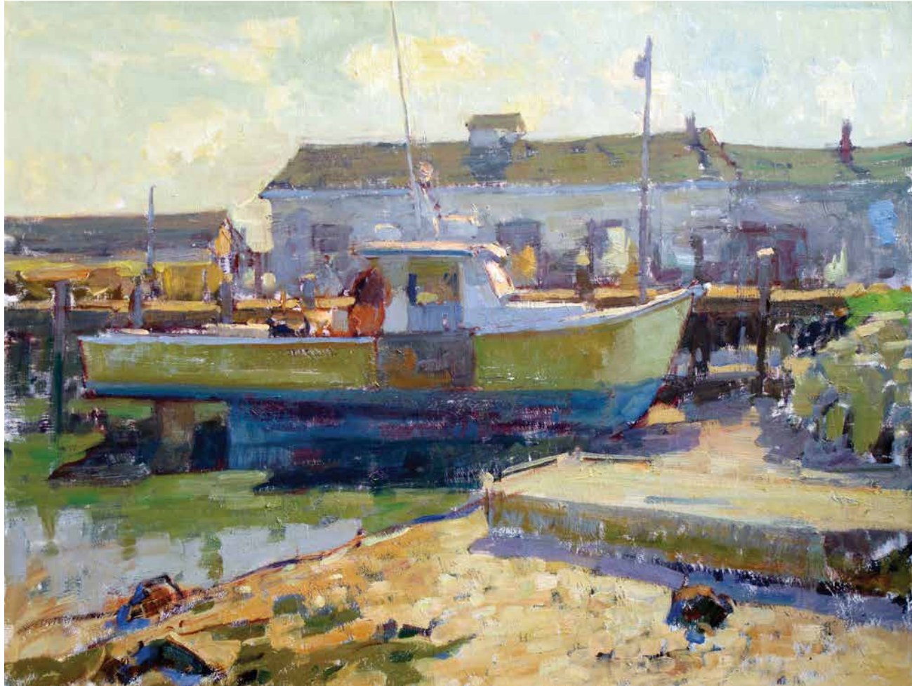
Lobster Boat 28 x 36 inches, oil on linen, 2012