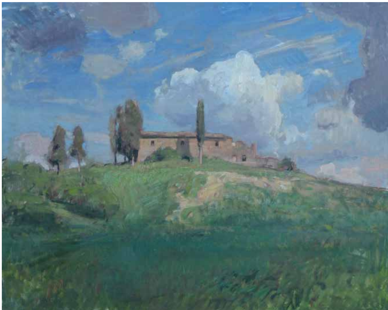
Abandoned House 31.5 x 39.5 inches, oil, 2011