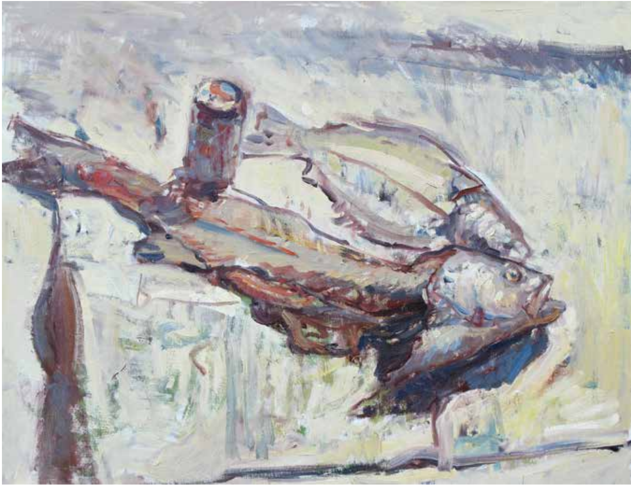
Striped Bass and Fluke 28 x 36 inches, oil on linen, 2011