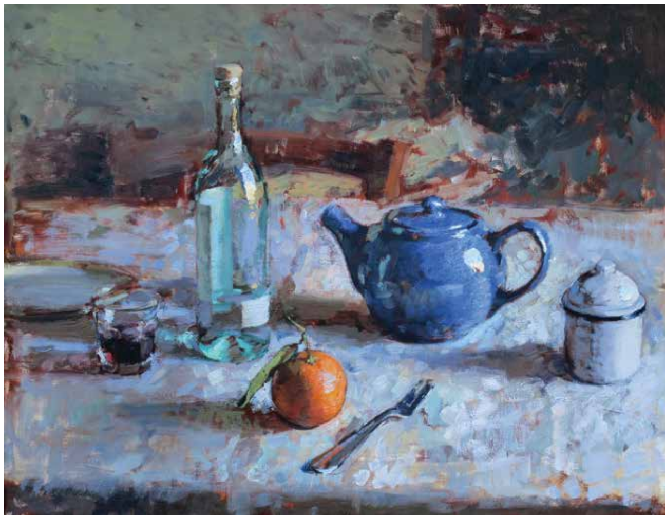
Still Life with Blue Teapot 28 x 36 inches, oil on linen, 2012