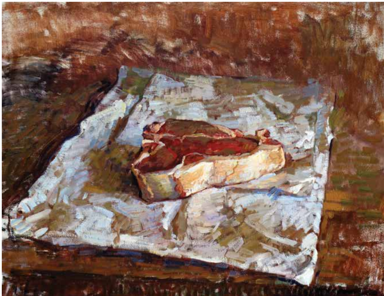
Fiorentina 28 x 36 inches, oil on linen, 2011