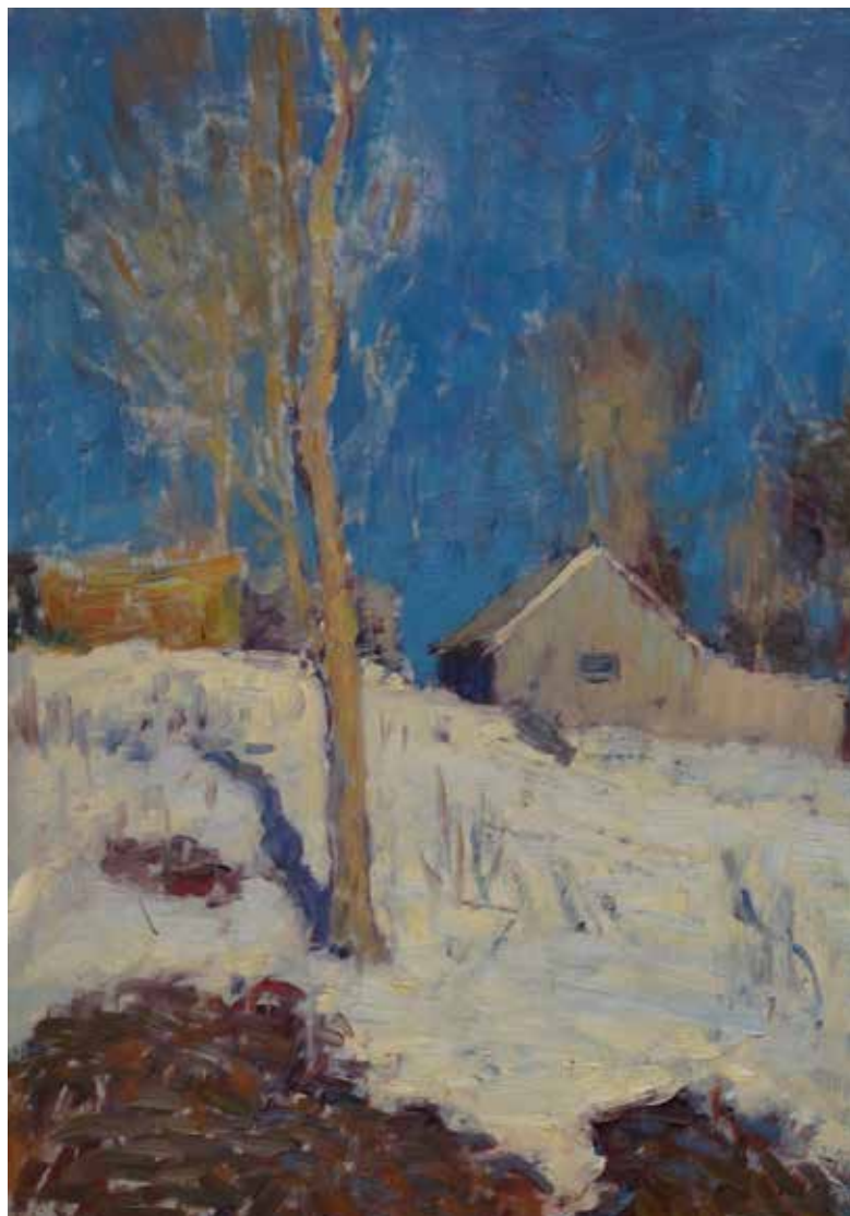
Maine Shack 24 x 18 inches, oil on panel, 2011