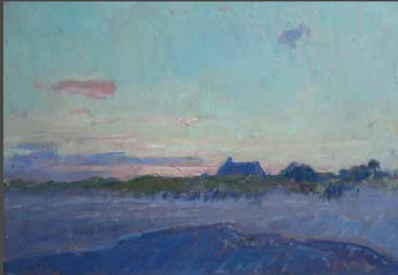
Beach House Sunset 18 x 25 inches, oil on linen, 2011