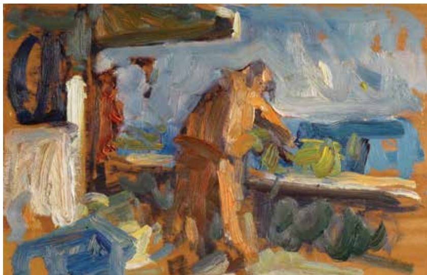
Hauling 8 x 12 inches, oil on panel, 2011