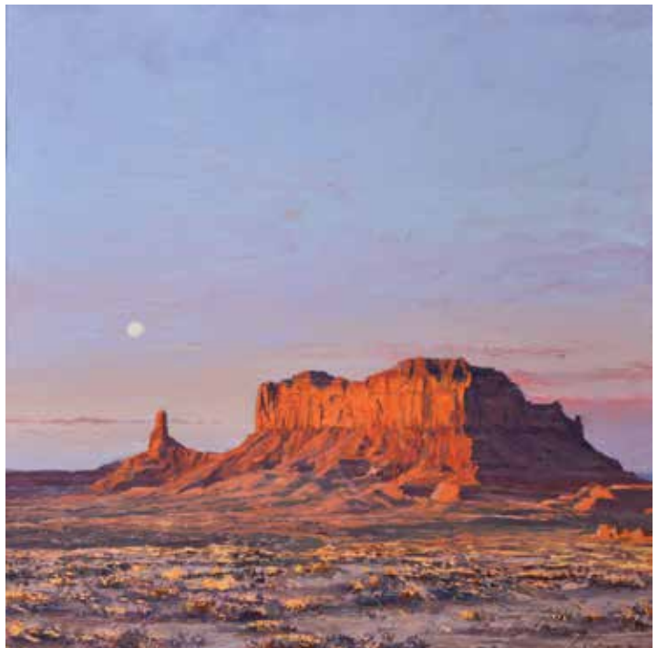
(CLOCKWISE FROM TOP LEFT) REBECCA ARGUELLO (b. 1977), Unnamed , 2025, oil on canvas, 18 x 24 in., available through the artist ■ MATTHEW J. CUTTER (b. 1974), Taking Flight , 2024, oil on canvas, 18 x 24 in., private collection ■ KIM LORDIER (b. 1966), Midnight Waltz , 2022, pastel on archival board, 27 x 40 in., private collection ■ ALEX ODNORALOV (b. 1994), Sonoran Dusk , 2024, oil on board, 20 x 20 in., private collection ■ PAUL KEYSAR (b. 1977), Moonlight Fog , 2025, oil on linen, 22 x 24 in., available through the artist