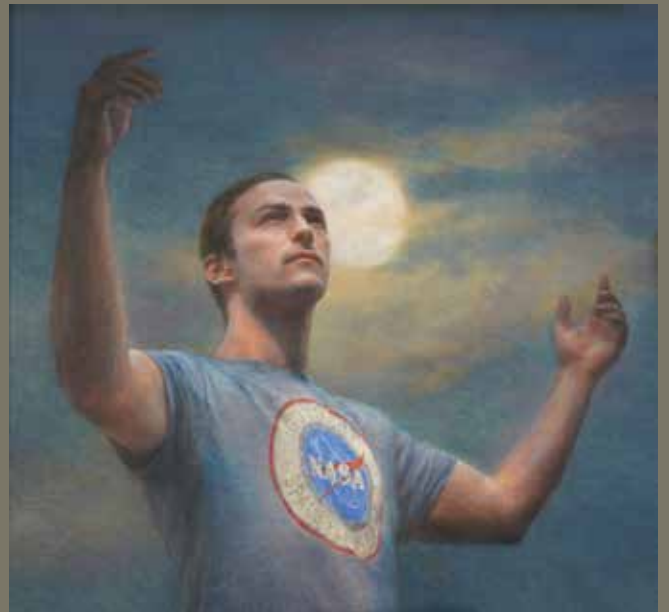
(TOP) GAYLE MADEIRA (b. 1969), Luminous Night , 2023, oil on linen panel, 18 x 24 in., available through the artist ■ (ABOVE LEFT) PAULA B. HOLTZCLAW (b. 1954), Morning's Embrace , 2025, oil on linen panel, 20 x 24 in., Cassens Fine Art (Hamilton, Montana) ■ (ABOVE RIGHT) JODIE KAIN (b. 1965), In My Dreams I've Already Been There , 2023, soft pastel on sanded paper, 19 x 20 in., available through the artist