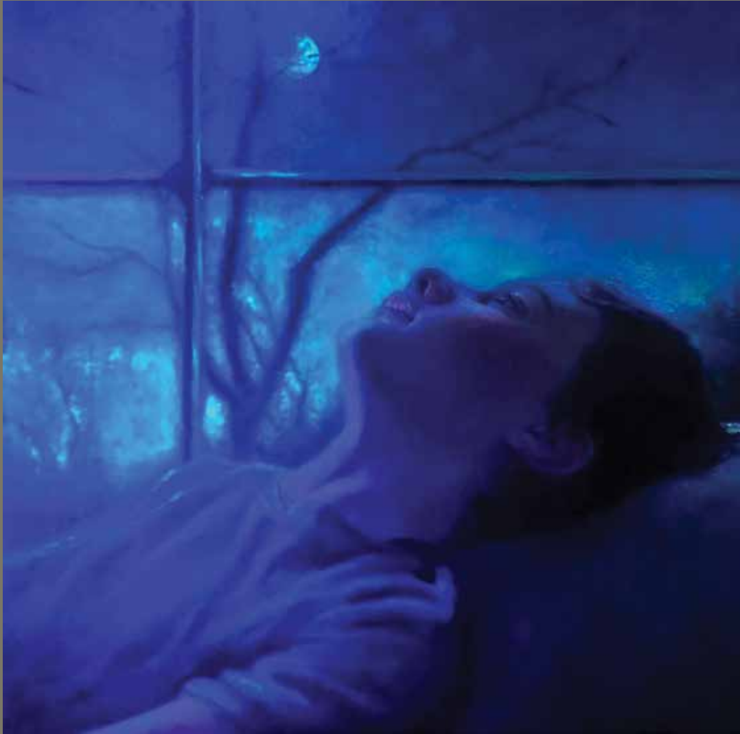
(LEFT) SARAH WARDA (b. 1967), Glimmer (With Lights Out) , 2024, oil, phosphorescent pigment, and strontium aluminate on cradled board, 12 x 12 in., 33 Contemporary Gallery (Lake Worth Beach, Florida) ■ (BELOW LEFT) LINDA H. POST (b. 1950), Under the Watchful Sky , 2025, oil on wood, 24 x 24 in., R. Michelson Galleries (Northampton, Massachusetts) ■ (BELOW RIGHT) DAGGI WALLACE (b. 1962), She's Often Inclined to Borrow Somebody's Dreams Till Tomorrow , 2024, pastel, acrylic, ink, and metallic watercolor on paper, 16 x 16 in., 33 Contemporary Gallery (Lake Worth Beach, Florida)