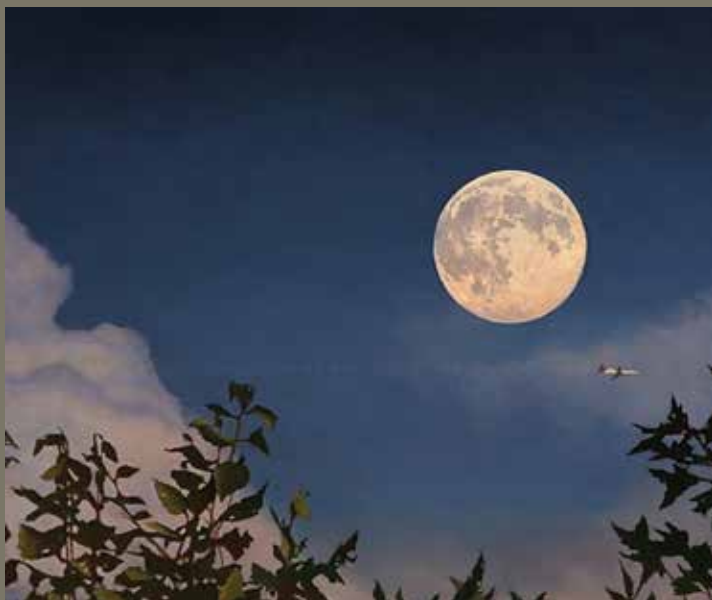
(CLOCKWISE) ANNA T. GUSTAFSON (b. 1980), Hope , 2023, oil on linen, 30 x 30 in., available through the artist ■ KIRK LARSEN (b. 1960), Schooner Moon , 2015, oil on wood panel, 6 x 6 in., private collection ■ STOCK SCHLUETER (b. 1949), Sundown Fog , 2024, oil on panel, 9 x 12 in., private collection ■ DAVID VICKERY (b. 1964), Transatlantic , 2014, oil on panel, 38 x 45 in., Dowling Walsh Gallery (Rockland, Maine) ■ DAVID PEIKON (b. 1958), Autumn Light , 2022, oil on linen, 36 x 48 in., Art Studio Hamptons (Westhampton Beach, Long Island)