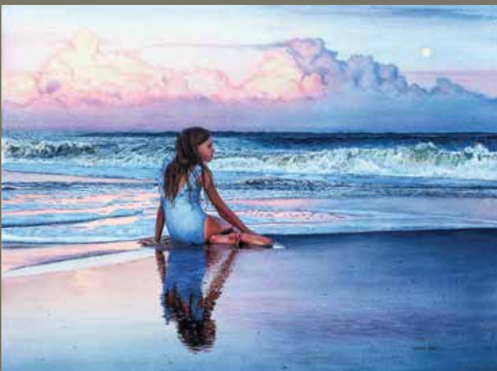
(CLOCKWISE FROM TOP LEFT) JASON BAILEY (b. 1982), Into the Sun , 2024, oil on linen panel, 12 x 12 in., private collection ■ VICTORIA BROOKS (b. 1954), Eats No Meat , 2024, oil and silver leaf on cradled wood, 16 x 12 in., available through the artist ■ JOHN CAGGIANO (b. 1949), Hazy Day , 2016, oil on linen panel, 11 x 14 in., Sheldon Fine Art (Naples, Florida) ■ MATTHEW BIRD (b. 1977), Farewell to the Beach , 2022, watercolor on paper, 22 x 30 in., available through the artist ■ VIKTOR BUTKO (b. 1978), March Twilight , 2025, oil on linen, 32 x 40 in., available through the artist