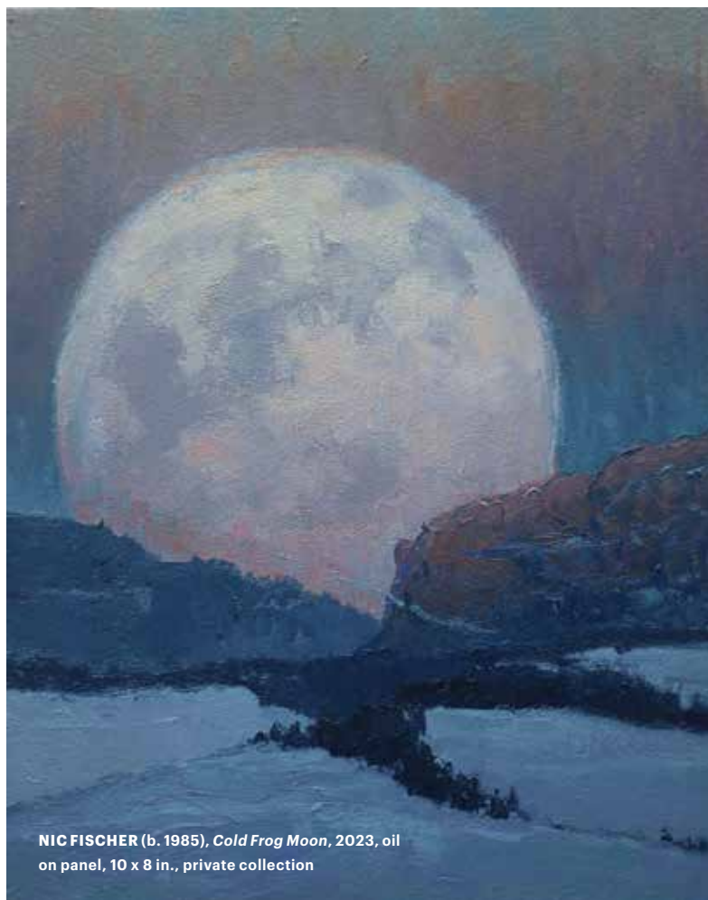
NIC FISCHER (b. 1985), Cold Frog Moon , 2023, oil on panel, 10 x 8 in., private collection

MAX GILLIES is a contributing writer to Fine Art Connoisseur .