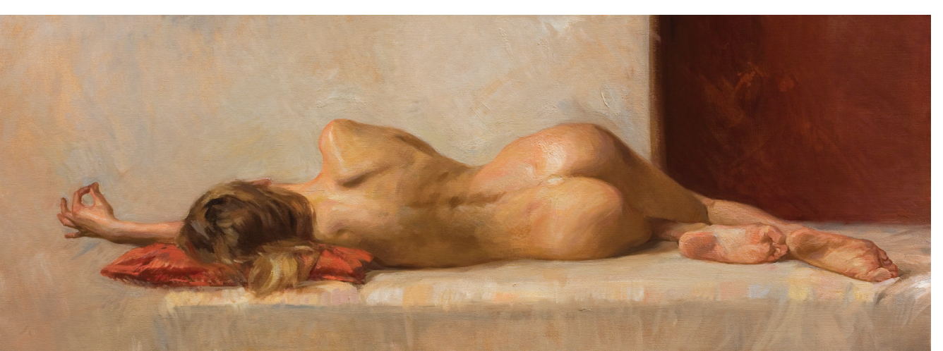
"Poppy" 53.5 x 20 inches, oil, 2011