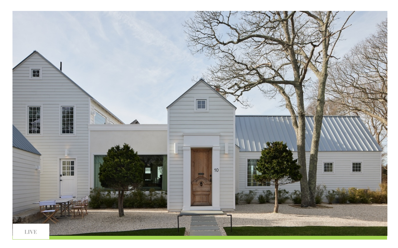
South Fork Dream Home: details for days in this Shelter Island stunner