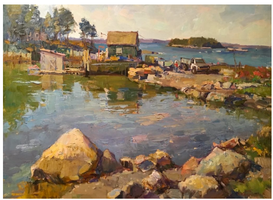
"Allen Cove" by Olga Karpacheva, 2016. Oil on canvas, 23.75 x 31.75 inches.

Aesthetically, the influence of photography in American landscape painting is prominent in the works on view. Most contemporary American painters use photography as a tool in making the work, said Powell, which affects compositional choices. A subtler influence of photography (and viewing art online) is a preference for graphic elements by the art viewing public. This also has an effect on the paintings being made, said Powell.