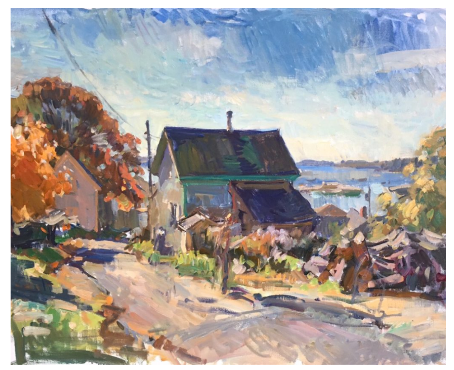
"Stonington, Maine" by Ben Fenske, 2016. Oil on canvas, 25.60 x 31.50 inches.