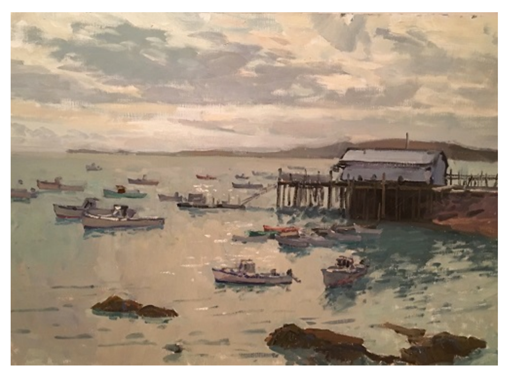
"Cloudy Day, Stonington" by Viktor Butko, 2016. Oil on canvas, 27.75 x 39.25 inches.