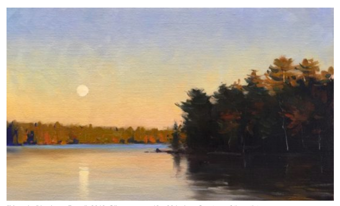
"Moonrise" by Jesse Powell, 2016. Oil on canvas, 12 x 20 inches.

For the Americans, the opportunity to watch the Russian painters at work provided insight into their training and encouraged some of the painters on the trip to experiment with their own techniques, said the artists interviewed about the trip. Another difference that encouraged the artists to stretch was the size of the canvas. The Russian painters tend to work large with some of the American painters following suit. A typical canvas size for American painters is 10 x 12 inches when painting en plein air, said Powell.