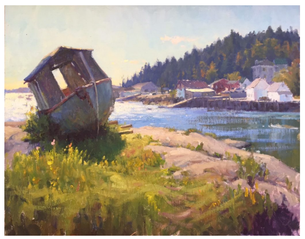
"Abandoned Boat - Stonington" by Carl Bretzke, 2016. Oil on linen, 16 x 20 inches.

In fact, there was only one scene that was painted by all the artists, said Grenning. One of the most challenging of the trip, the scene featured a boat on its side on the shore with water snaking behind it and a village rising on the opposite shore. In the painting on view in the exhibition, Abandoned Boat - Stonington by Carl Bretzke, 2016, the boat may draw the eye first but the light infused water pulls the viewer into the scene, moving around the boat and deeper into the painting in an intriguing visual journey.