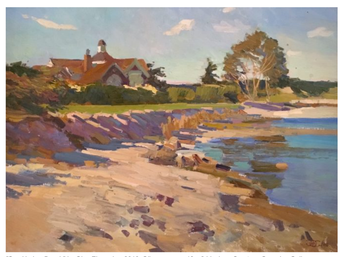
"Sag Harbor Beach" by Oleg Zhuravlev, 2016. Oil on canvas, 18 x 24 inches.

The exhibition presents a rare opportunity to examine the difference between the Russian tradition of plein air painting and the Italian approach as applied by American painters. Nearly all the American painters have studied or, in some cases, taught at the Florence Academy of Art in Italy. Many continue to teach in the United States either through their own studios or through formal schools.