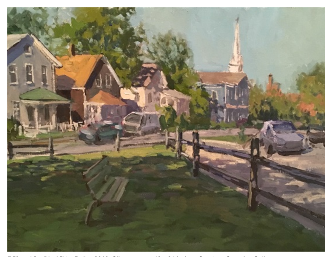
"Village View" by Viktor Butko, 2016. Oil on canvas, 18 x 24 inches.

"I jumped at the chance to be able to visit Plyos and to see the same views that Isaac Levitan did," said Powell in a phone interview about the 2013 trip. "Plyos is like the Russian Giverny."