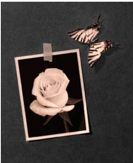
J.D. HILLBERRY (b. 1958), Fooled , 2013, charcoal, graphite, and carbon pencil on paper, 14 x 11 in., Collection of the artist