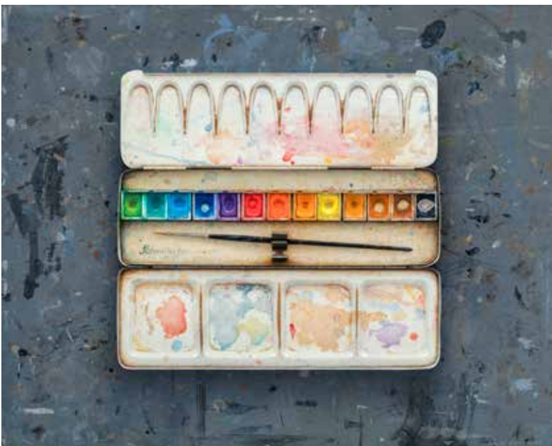
ALAN MAGEE (b. 1947), Battlefield , 2016, acrylic and oil on panel, 36 1/4 x 45 in., Forum Gallery, New York City