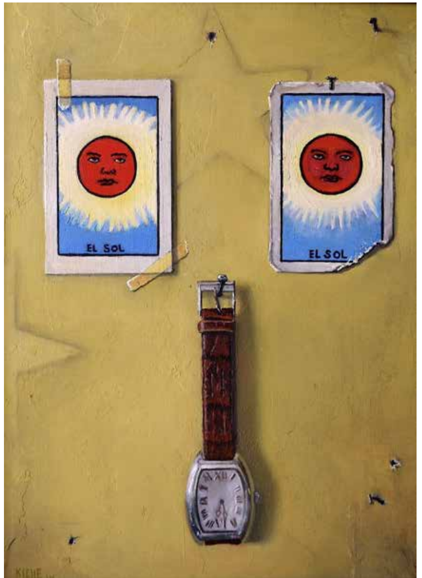
SCOTT KICHE (b. 1974), Time between Two Suns , 2013, oil on board, 14 x 11 in., Collection of the artist