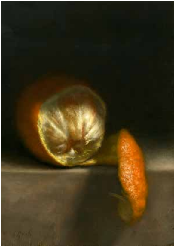
JONATHAN KOCH (b. 1971), One Orange Peeled , 2009, oil on linen, 7 x 6 in., Private collection