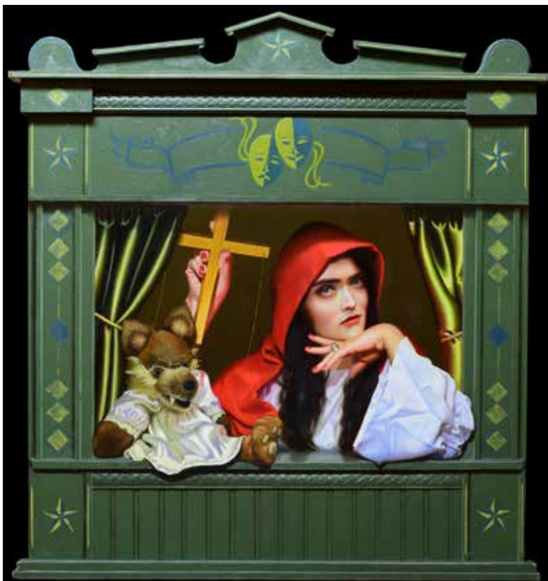
TIM TYLER (b. 1958), Puppetmaster , 2015, oil on panel, 33 x 36 in., MTFA Contemporary Art, Santa Fe