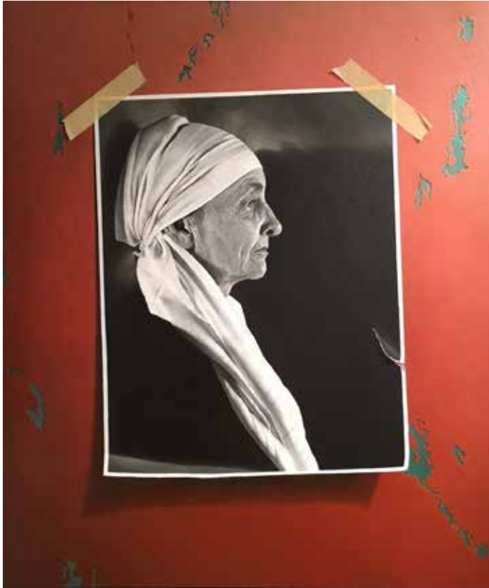
OTTO DUECKER (b. 1948), Georgia O'Keeffe , 2011, oil on board, 19 x 15 1/2 in., Raven Gallery, Aspen