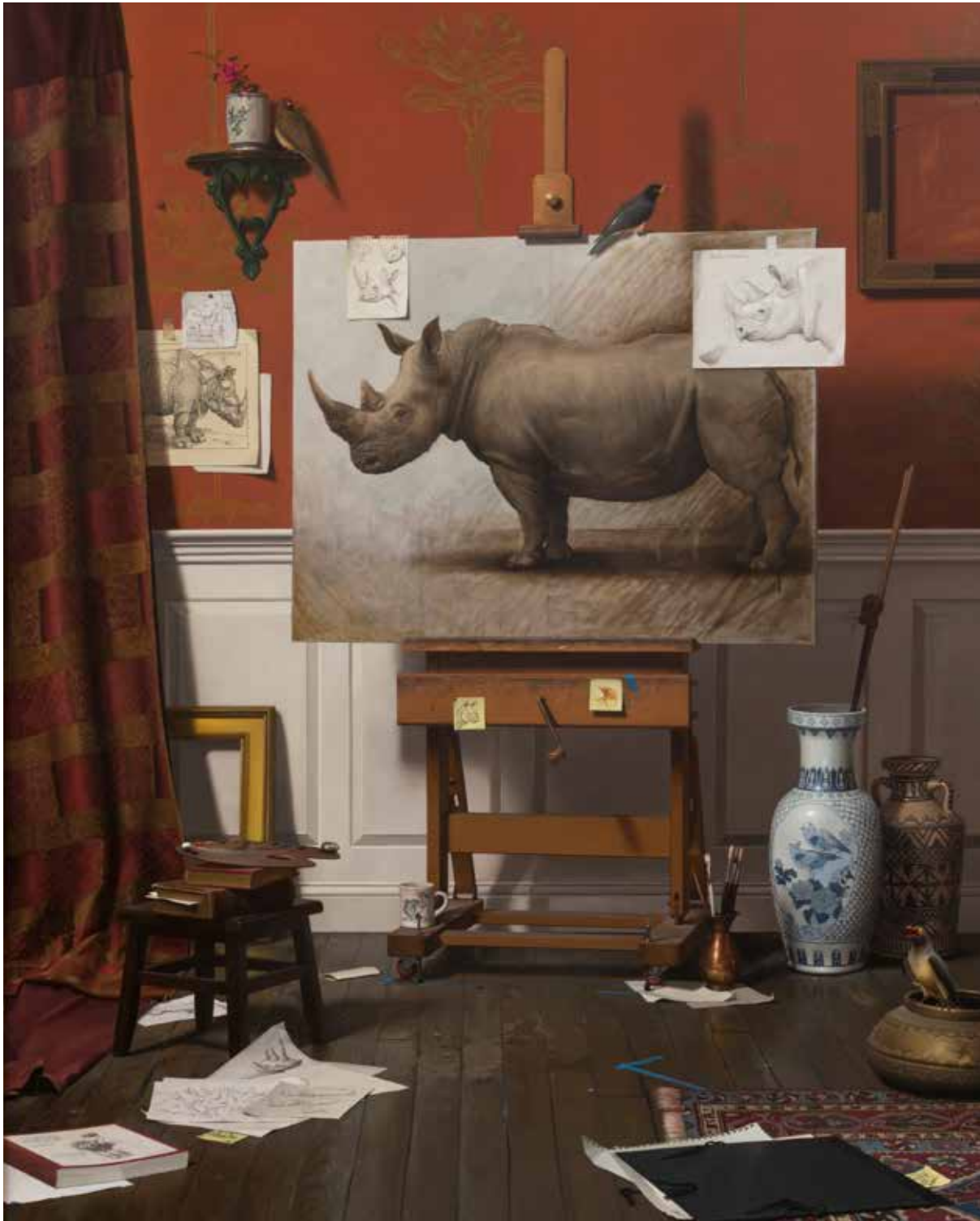
TONY CURANAJ (b. 1973), Oblivion , 2014, oil on canvas, 90 x 65 in., Private collection

(OPPOSITE PAGE TOP) WILLIAM ACHEFF (b. 1947), Santo Domingo , 2015, oil on board, 6 x 8 in., Saks Galleries, Denver ■ (OPPOSITE PAGE bottom) NOAH BUCHANAN (b. 1976), Embrace I , 2010, oil on panel, 14 x 11 in., Collection of the Bay Area Classical Artist Atelier