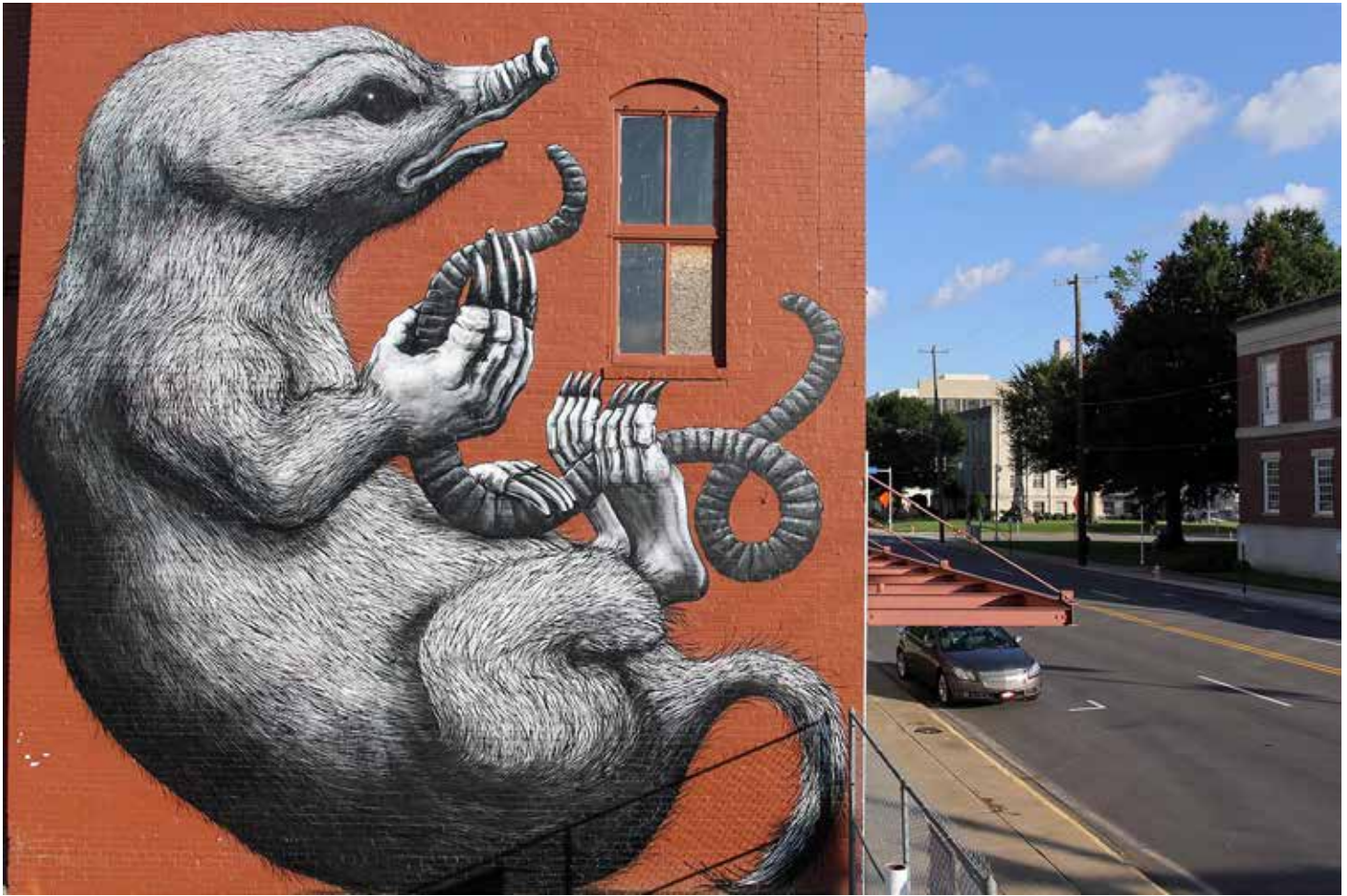
ROA (b. 1976), Mole , building-sized mural painted last September as part of Unexpected , the first mural festival presented by 64.6 Downtown and JUSTKIDS in Fort Smith, Arkansas