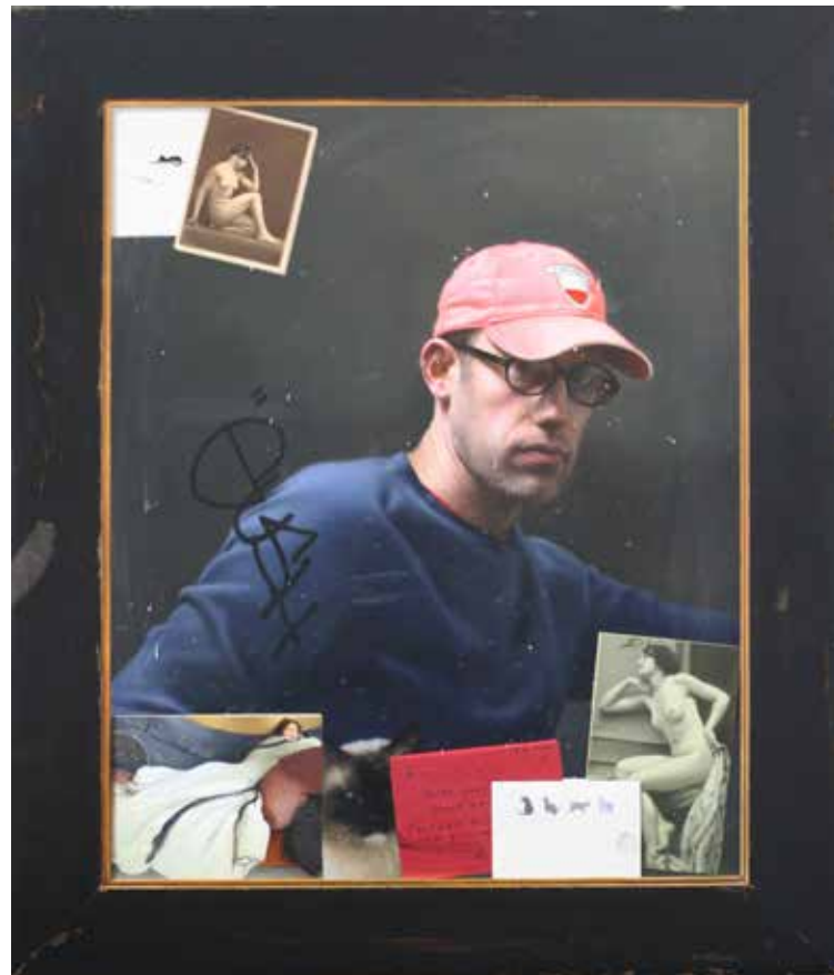
ADAM VINSON (b. 1978), Hoopla , 2016, oil on panel, 28 x 24 in., On view at Sloane Merrill Gallery (Boston) through July 8