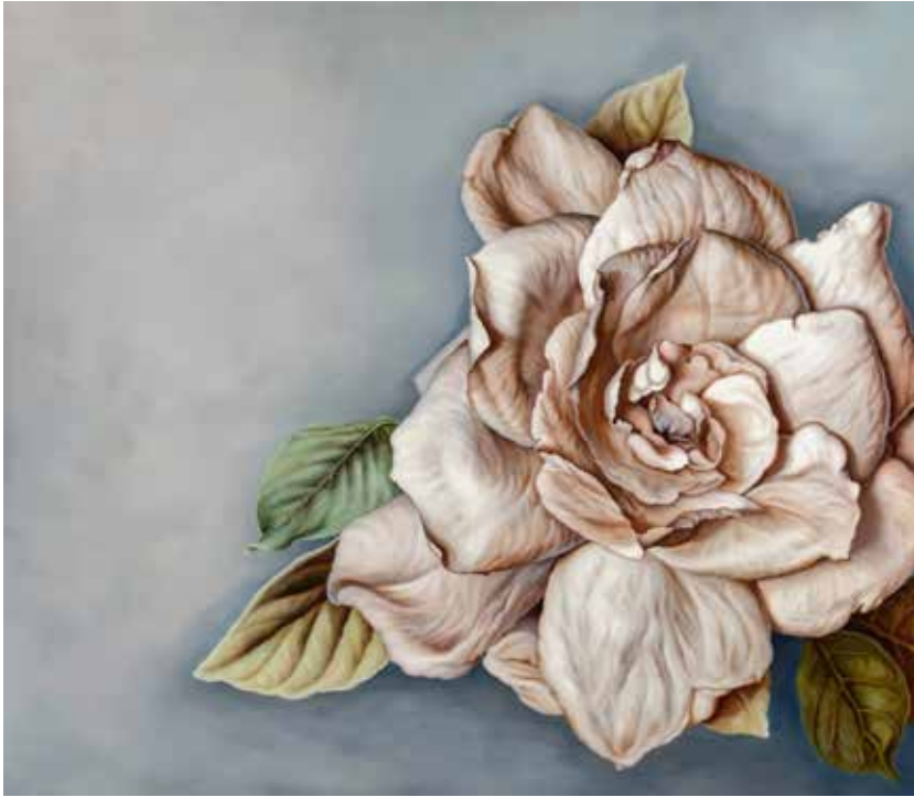
CARIN GERARD (b. 1958), Gardenia Repose , 2016, oil on linen, 72 x 84 in., Private collection