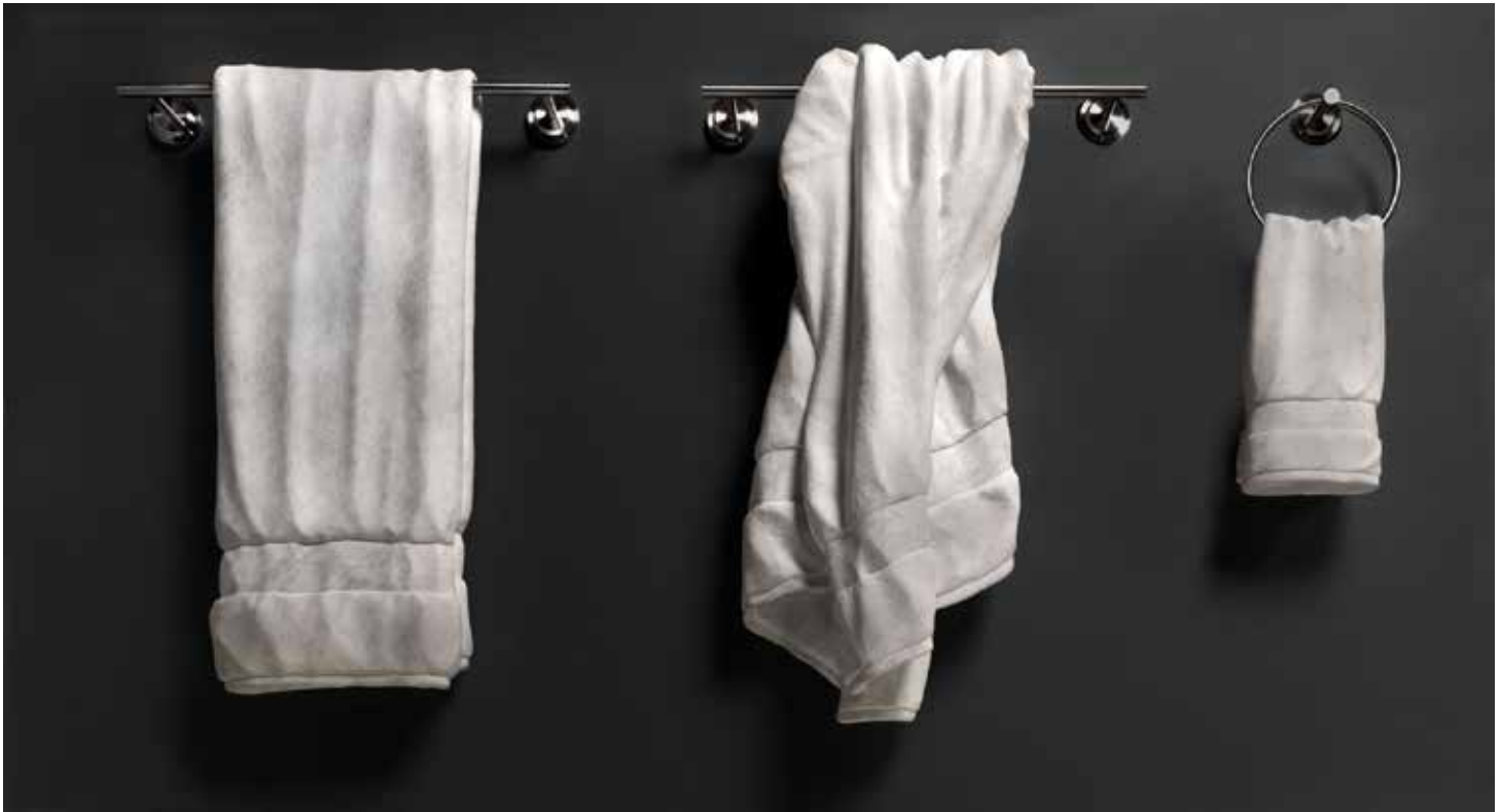
SEBASTIAN MARTORANA (b. 1981), Yours, Mine & Ours (overall and detail), 2010, Italian Carrara marble and steel hardware, middle towel measures 33 x 8 x 18 in