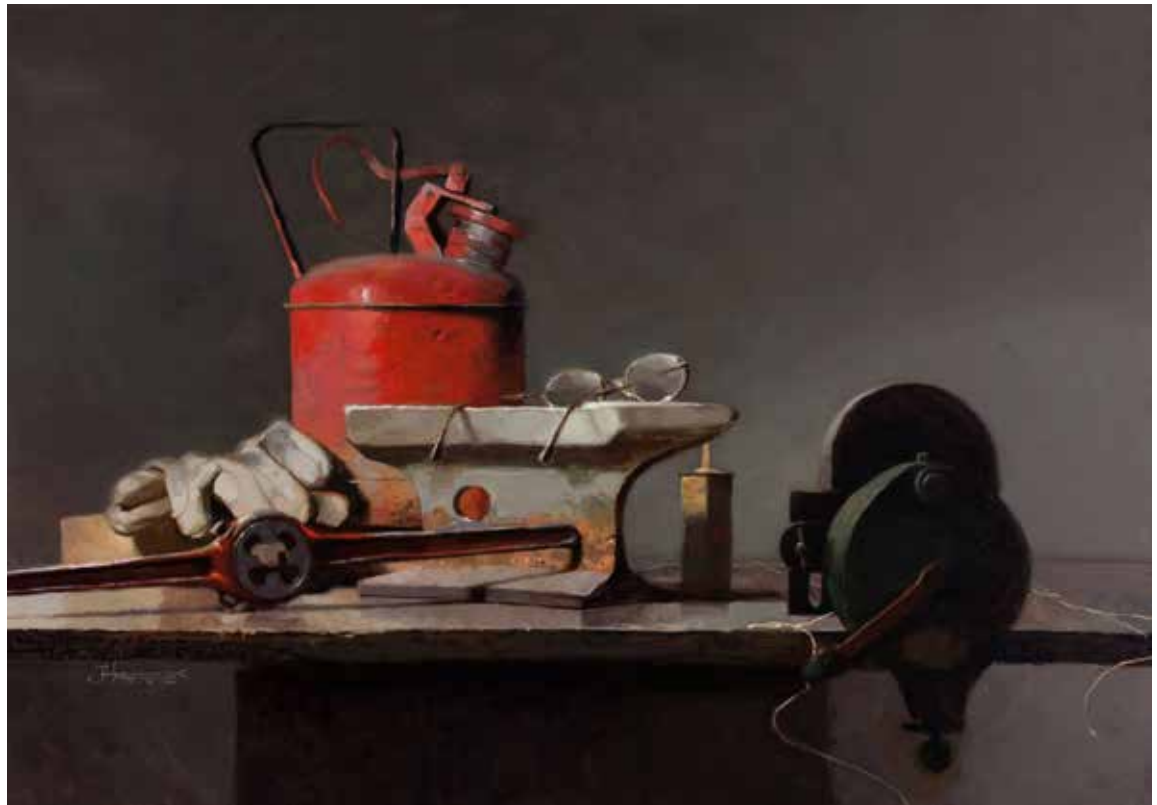
JEFFREY D. HARGREAVES (b. 1949), Solvent and Die Set , 2013, oil on linen, 24 x 36 in., Private collection